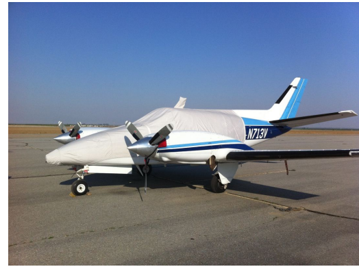
Beech B60 Duke Canopy/Nose Cover