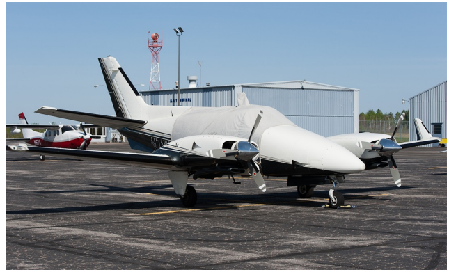
Beech Duke Canopy Cover