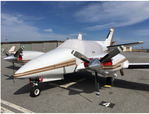
Beech Duke Canopy Cover, Engine Plugs, Pitot Covers