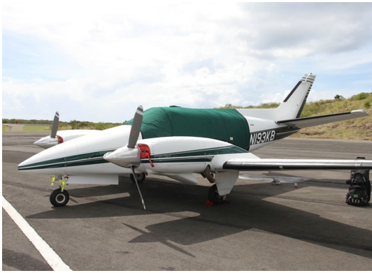
Beech Duke Canopy Cover, Engine Plugs