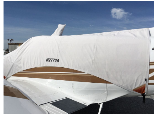
Beech Duke Canopy Cover