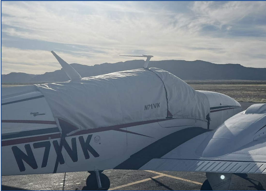
Beech 95-C55 Canopy Cover (Large windshield &amp; large 3rd window)