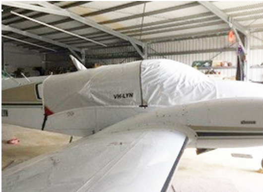
Baron FULL COVER SET, Light Weight Travel &/or Fitted Dust Cover Set