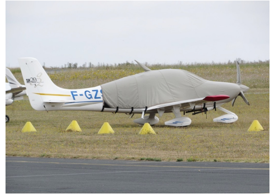
Cirrus SR-22 Extended Canopy/Engine Cover, Prop Cover, Wingtip Pads