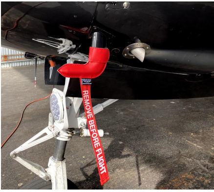
Baron 58 Pitot Cover