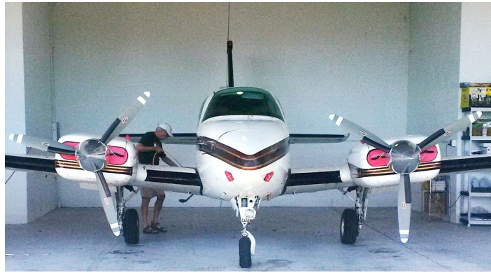
Beech Baron 58 Engine Inlet Plugs, Heater Inlet Plugs