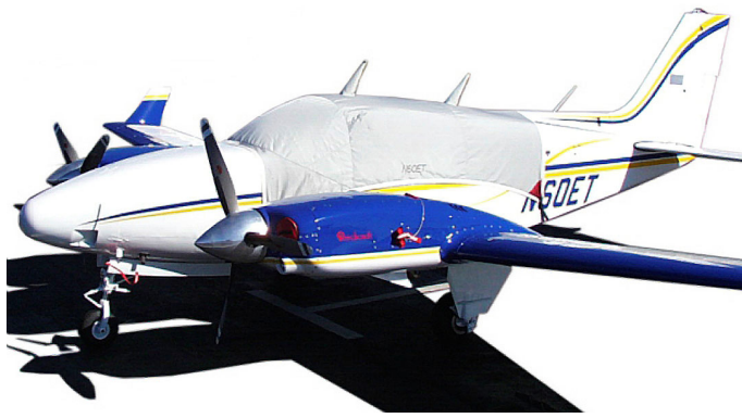
Standard Canopy Cover & Engine Plugs