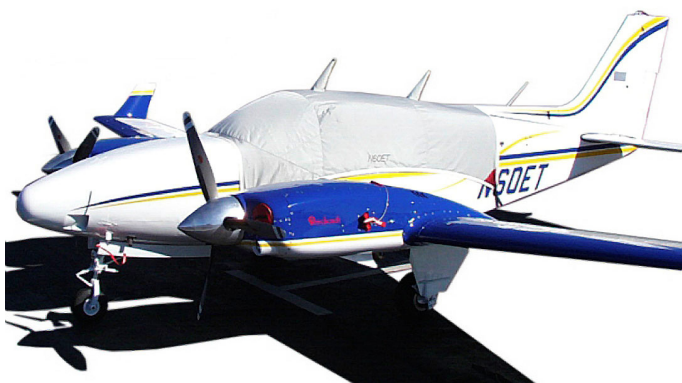
Standard Canopy Cover & Engine Plugs

Travel Covers are made with Silver Solution-Dyed Polyester fabric and only lined over the windshield to save weight. The material is lightweight and more compact for easy stowage in the aircraft. The polyester material is water resistant, but only intended for occasional use outside. We also have an ultra lightweight material available for fitted hangar dust covers. For daily outdoor use, the non-travel Sunbrella Cover is the best choice.