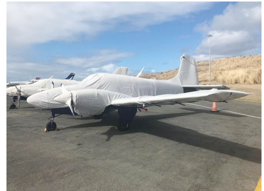
Beech Travel Air Full Cover Set