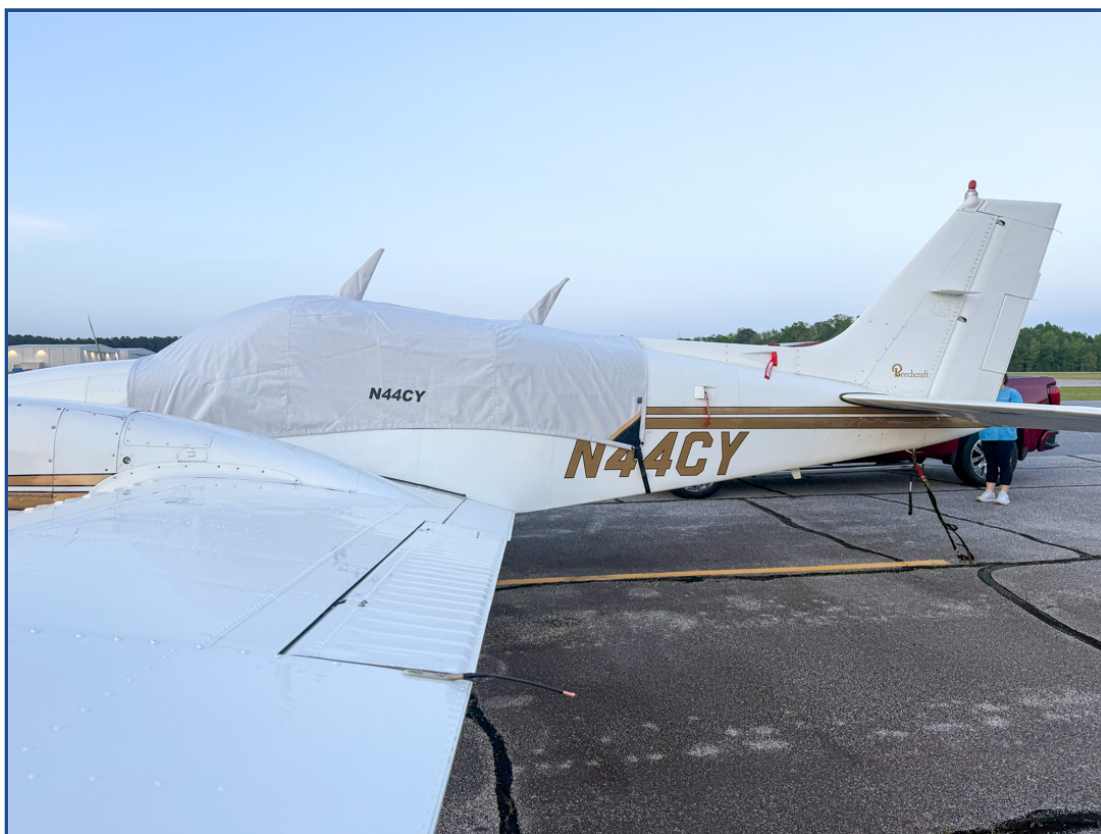
Beech Baron B55 Canopy Cover