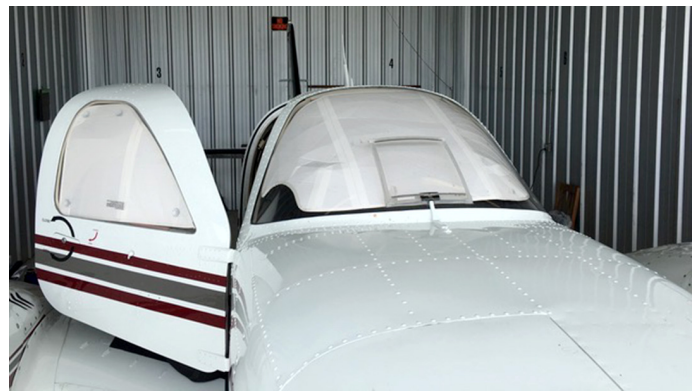
Beech Baron 58P Cockpit Heatshield Set