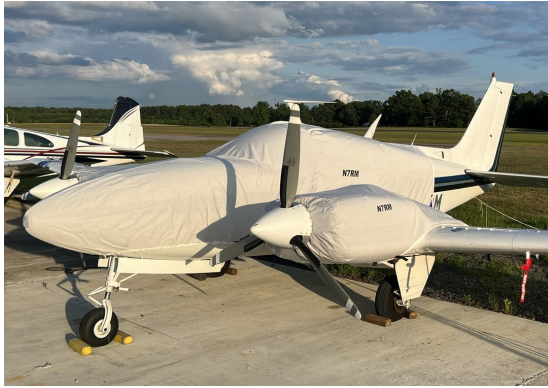
Beech C55 Baron Extended Canopy/Nose Cover, Engine Covers

This cover type is made from Silver Acrylic Sunbrella canvas and is 100% lined with a soft and smooth microfiber. Bruce's Custom Covers developed this material combination especially for aircraft protection. The outer material is medium weight and treated for water resistance, UV resistance and anti-static buildup. The inner lining is a very soft and smooth microfiber to prevent scratching. The material is very reflective, and tests show that the cabin interior temperature can be reduced to near-ambient temperature on the hottest of days. It is water, ice and snow repellent, yet breathable to allow moisture to escape from between the cover and the aircraft surface.