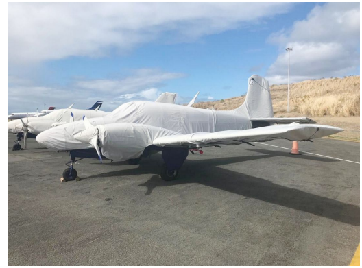
Beech Travel Air Full Cover Set