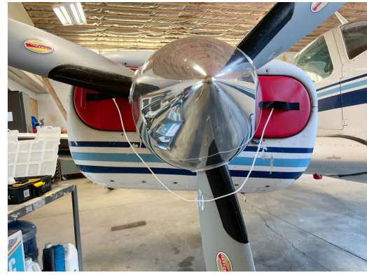
Beech Baron B-55 Engine Plugs