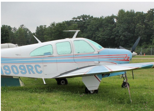
Beech Bonanza/Debonair HeatShield Set

Windshield Heatshields are interior sunshades for an aircraft's front windshield. The product is a unique composite of closed-cell foam with a silver mylar finish. The semi-rigid design is stiff enough to stand along the inside of the windshield using sun visors or window framing. It folds up flat and easily stores in the included storage sleeve. Some designs may require velcro and suction cups or split right and left sides. A Heatshield is an excellent short-term remedy for cockpit overheating. An external fabric cover is far more effective and practical for long-term protection.