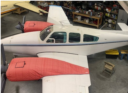
Beech Baron B55 Insulated Engine Covers

This cover type is made from Silver Acrylic Sunbrella canvas and is 100% lined with a soft and smooth microfiber. Bruce's Custom Covers developed this material combination especially for aircraft protection. The outer material is medium weight and treated for water resistance, UV resistance and anti-static buildup. The inner lining is a very soft and smooth microfiber to prevent scratching. The material is very reflective, and tests show that the cabin interior temperature can be reduced to near-ambient temperature on the hottest of days. It is water, ice and snow repellent, yet breathable to allow moisture to escape from between the cover and the aircraft surface.