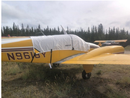
Beech A55 Baron Canopy Cover

This cover type is made from Silver Acrylic Sunbrella canvas and is 100% lined with a soft and smooth microfiber. Bruce's Custom Covers developed this material combination especially for aircraft protection. The outer material is medium weight and treated for water resistance, UV resistance and anti-static buildup. The inner lining is a very soft and smooth microfiber to prevent scratching. The material is very reflective, and tests show that the cabin interior temperature can be reduced to near-ambient temperature on the hottest of days. It is water, ice and snow repellent, yet breathable to allow moisture to escape from between the cover and the aircraft surface.