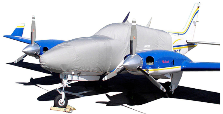
Baron Canopy/Nose Cover