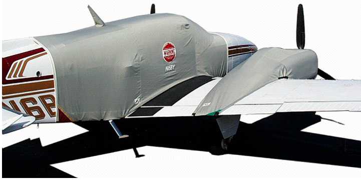
Baron Extended Canopy Cover & Engine Covers

Covers developed this material combination especially for aircraft protection. The outer material is medium weight and treated for water resistance, UV resistance and anti-static buildup. The inner lining is a very soft and smooth microfiber to prevent scratching. The material is very reflective, and tests show that the cabin interior temperature can be reduced to near-ambient temperature on the hottest of days. It is water, ice and snow repellent, yet breathable to allow moisture to escape from between the cover and the aircraft surface.