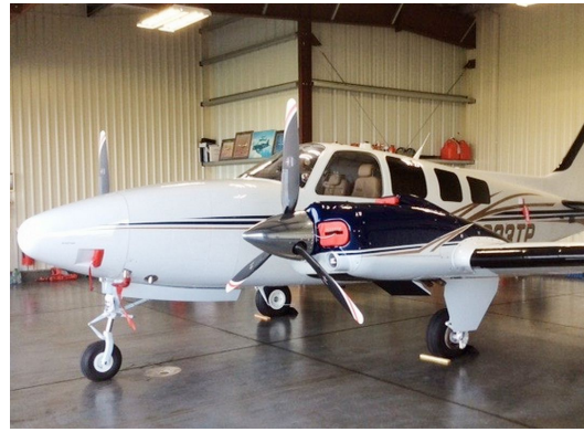
Beech Baron 58 Engine Inlet Plugs, Cowl Top Plugs, Heater Inlet, Pitot Cover