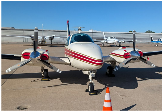
Beech Baron C-55 Engine Plugs