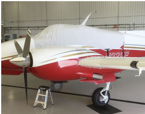
Beech Twin Bonanza D50A Canopy Cover