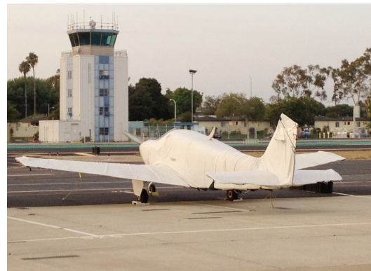
A36 Bonanza Full Cover Set