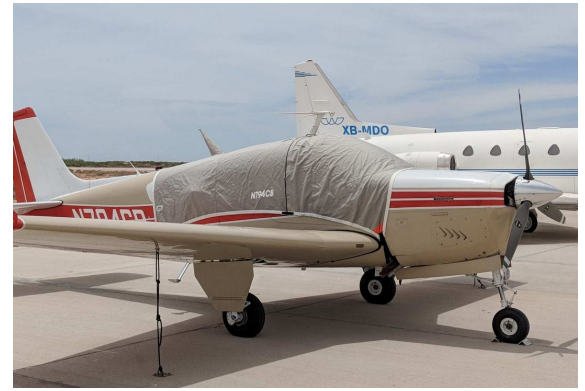
Beech Bonanza/Debonair Travel Cover, Light Weight Travel Canopy Cover