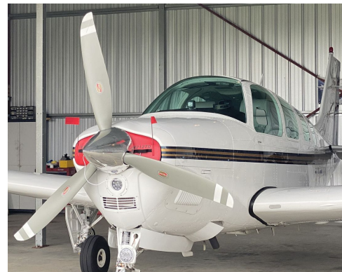
Bonanza A36 Engine Plugs