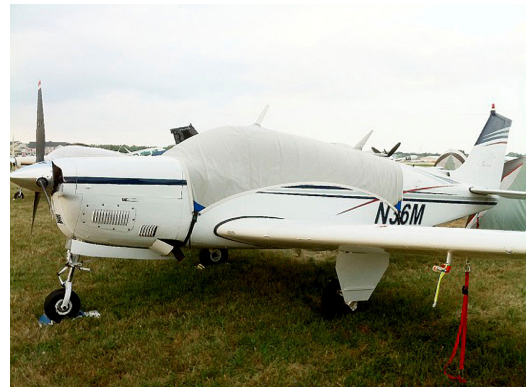
A36 Bonanza Standard Canopy Cover