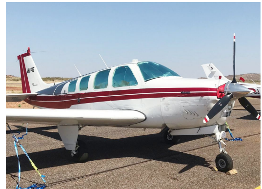
Beech A-36 Bonanza Cabin HeatShields