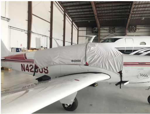
Beech A36 Bonanza Canopy Cover

This cover type is made from Silver Acrylic Sunbrella canvas and is 100% lined with a soft and smooth microfiber. Bruce's Custom Covers developed this material combination especially for aircraft protection. The outer material is medium weight and treated for water resistance, UV resistance and anti-static buildup. The inner lining is a very soft and smooth microfiber to prevent scratching. The material is very reflective, and tests show that the cabin interior temperature can be reduced to near-ambient temperature on the hottest of days. It is water, ice and snow repellent, yet breathable to allow moisture to escape from between the cover and the aircraft surface.