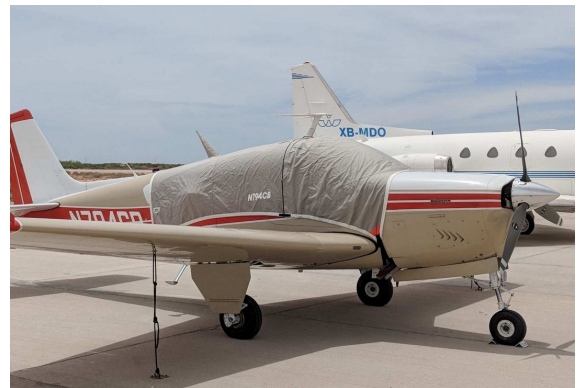
Beech Bonanza F33A Light Weight Travel Cover