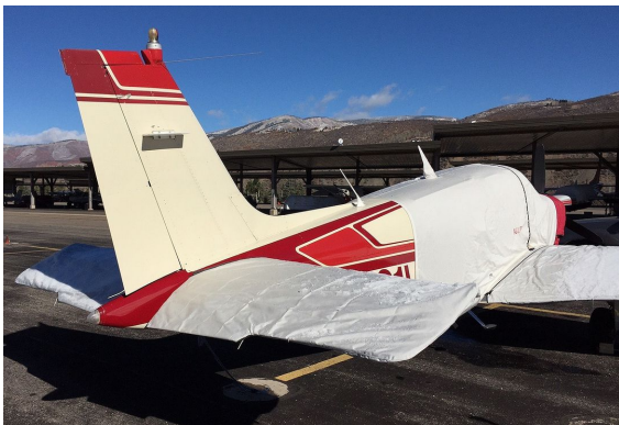
Beech Bonanza A36 Horizontal Stab, Extended Canopy, Wing Covers

WINTER USE MATERIAL - Made with Solution-Dyed Polyester fabric, this option is intended for seasonal use to aid in deicing, rain mitigation, or for occasional travel. The material is lighter and more compact, but more susceptible to UV damage and may have a shorter useful life if used continuously outside than the all-year use material.