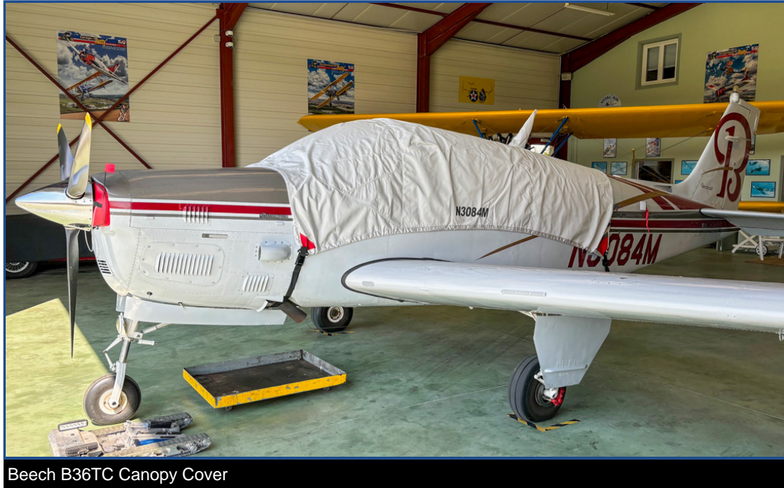
Beech B36TC Canopy Cover