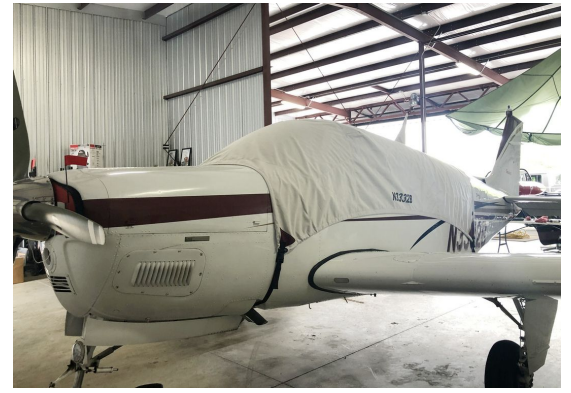
A36 Engine Inlet Plugs