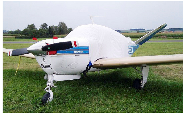
Bonanza Extended Canopy Cover & Engine Inlet Plugs