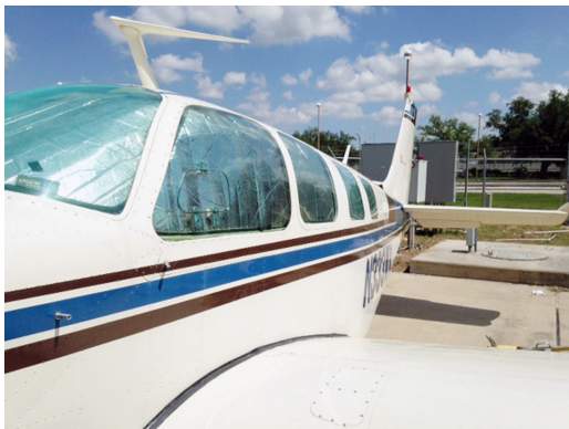
Beech Bonanza HeatShields

Windshield Heatshields are interior sunshades for an aircraft's front windshield. The product is a unique composite of closed-cell foam with a silver mylar finish. The semi-rigid design is stiff enough to stand along the inside of the windshield using sun visors or window framing. It folds up flat and easily stores in the included storage sleeve. Some designs may require velcro and suction cups or split right and left sides. A Heatshield is an excellent short-term remedy for cockpit overheating. An external fabric cover is far more effective and practical for long-term protection.