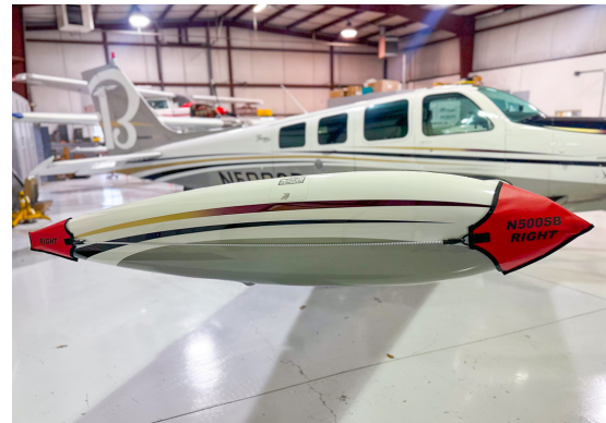
Beech A36 Fresh Air Inlet/Exhaust Plugs Tip Tank Safety Pads