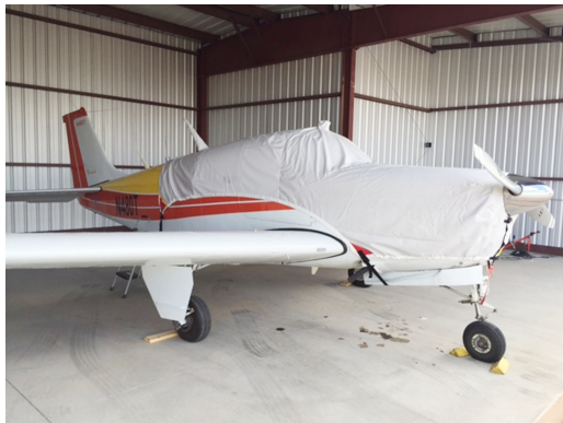
Beech Bonanza Canopy/Engine Cover

This cover type is made from Silver Acrylic Sunbrella canvas and is 100% lined with a soft and smooth microfiber. Bruce's Custom Covers developed this material combination especially for aircraft protection. The outer material is medium weight and treated for water resistance, UV resistance and anti-static buildup. The inner lining is a very soft and smooth microfiber to prevent scratching. The material is very reflective, and tests show that the cabin interior temperature can be reduced to near-ambient temperature on the hottest of days. It is water, ice and snow repellent, yet breathable to allow moisture to escape from between the cover and the aircraft surface.