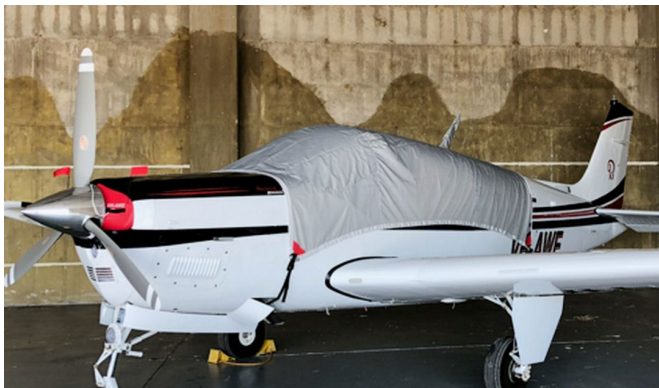
Beech G36 Bonanza Light Weight Travel Canopy Cover, & Engine Plugs

Travel Covers are made with Silver Solution-Dyed Polyester fabric and only lined over the windshield to save weight. The material is lightweight and more compact for easy stowage in the aircraft. The polyester material is water resistant, but only intended for occasional use outside. We also have an ultra lightweight material available for fitted hangar dust covers. For daily outdoor use, the non-travel Sunbrella Cover is the best choice.