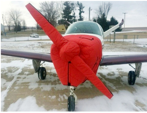
Bonanza Insulated Engine and Prop Cover