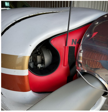
Beech A36 Engine Inlet Plugs (285HP-300HP) Large Bonanza, not for "hot prop" (set of 2), WITH HEATER HOSE INLET