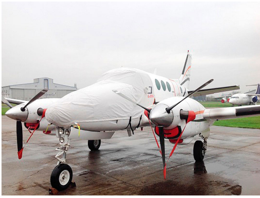
King Air Cockpit/Nose Cover, Plugs, Prop Tie/Exhaust Covers