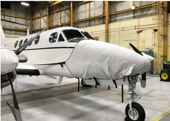
King Air 200 Nose Cover