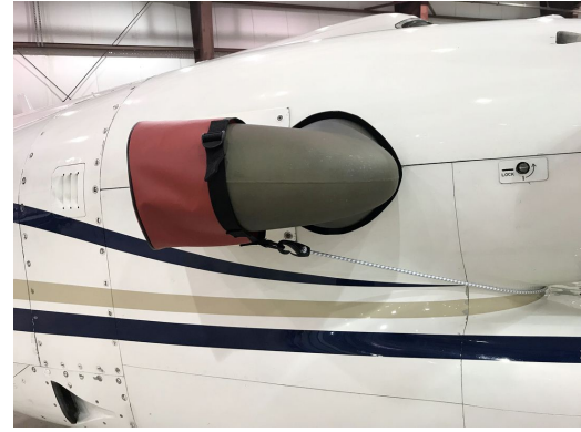
Beech King Air 350 Exhaust Covers