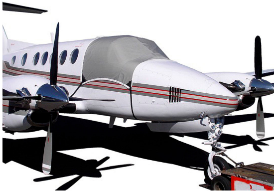
King Air 200/300 Snap-On Windshield Cover