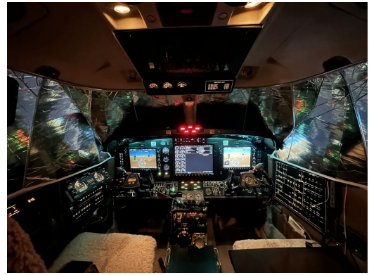
Beechcraft B200 Cockpit Heatshields