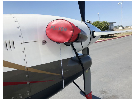
Beech King Air 350 Prop Tie-Downs/Exhaust Covers Combination