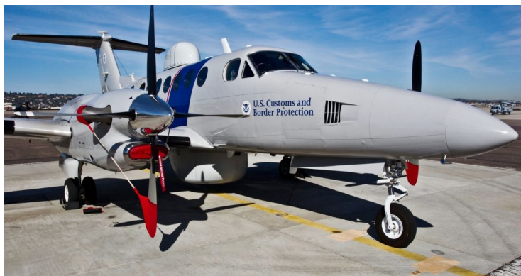
King Air 350 Engine Plugs, Prop Tie/Exhaust Covers