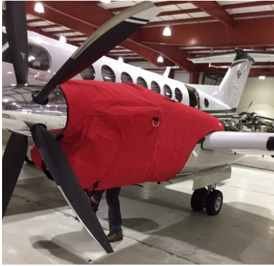
Beech King Air 200 Insulated Engine Cover

This cover type is made from Silver Acrylic Sunbrella canvas and is 100% lined with a soft and smooth microfiber. Bruce's Custom Covers developed this material combination especially for aircraft protection. The outer material is medium weight and treated for water resistance, UV resistance and anti-static buildup. The inner lining is a very soft and smooth microfiber to prevent scratching. The material is very reflective, and tests show that the cabin interior temperature can be reduced to near-ambient temperature on the hottest of days. It is water, ice and snow repellent, yet breathable to allow moisture to escape from between the cover and the aircraft surface.