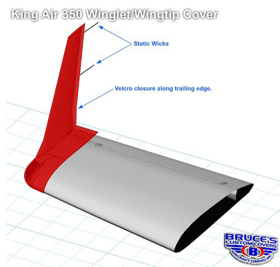
King Air Winglet/Wingtip Cover (King Air 350)

WINTER USE MATERIAL - Made with Solution-Dyed Polyester fabric, this option is intended for seasonal use to aid in deicing, rain mitigation, or for occasional travel. The material is lighter and more compact, but more susceptible to UV damage and may have a shorter useful life if used continuously outside than the all-year use material.