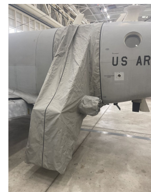
King Air Airstair Cover