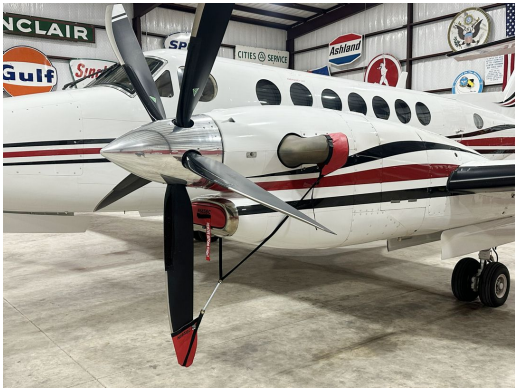
King Air 300 Prop-Tie Downs/Exhaust Covers (set of 6)