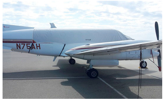
King Air 350 Canopy Cover