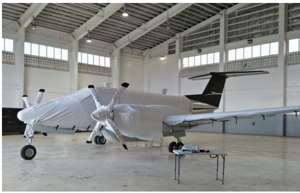
King Air 350