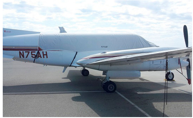
King Air 350 Canopy Cover