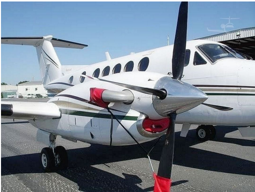
Beech King Air 200 Prop Tie-Downs/Exhaust Covers (Commuter Air Technology Exhaust Stacks)

This cover type is made from Silver Acrylic Sunbrella canvas and is 100% lined with a soft and smooth microfiber. Bruce's Custom Covers developed this material combination especially for aircraft protection. The outer material is medium weight and treated for water resistance, UV resistance and anti-static buildup. The inner lining is a very soft and smooth microfiber to prevent scratching. The material is very reflective, and tests show that the cabin interior temperature can be reduced to near-ambient temperature on the hottest of days. It is water, ice and snow repellent, yet breathable to allow moisture to escape from between the cover and the aircraft surface.