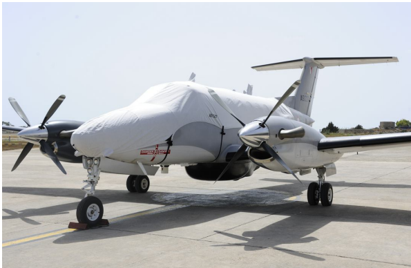
King Air 200 Canopy/Nose Cover

Covers developed this material combination especially for aircraft protection. The outer material is medium weight and treated for water resistance, UV resistance and anti-static buildup. The inner lining is a very soft and smooth microfiber to prevent scratching. The material is very reflective, and tests show that the cabin interior temperature can be reduced to near-ambient temperature on the hottest of days. It is water, ice and snow repellent, yet breathable to allow moisture to escape from between the cover and the aircraft surface.