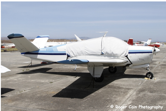
Beech Bonanza Canopy Cover

Travel Covers are made with Silver Solution-Dyed Polyester fabric and only lined over the windshield to save weight. The material is lightweight and more compact for easy stowage in the aircraft. The polyester material is water resistant, but only intended for occasional use outside. We also have an ultra lightweight material available for fitted hangar dust covers. For daily outdoor use, the non-travel Sunbrella Cover is the best choice.