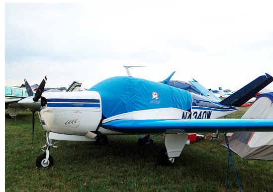
Beech Bonanza Canopy Cover with Bonanzas to Oshkosh B2Osh logo