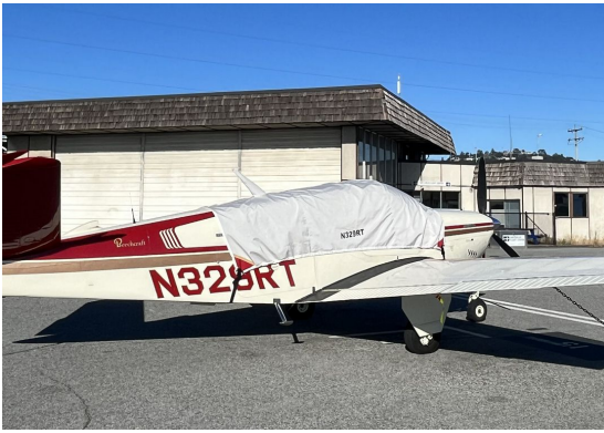
Bonanza V35B Canopy Cover