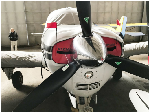
Beech Bonanza Engine Plugs