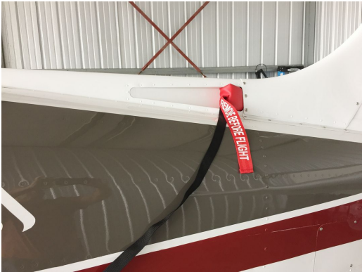
Beech Bonanza/Baron Fresh Air Intake & Exhaust Plugs

Engine Inlet Plugs are custom fit for your Beech Bonanza/Debonair intakes, made with heavy-duty vinyl material, and stuffed with a single block of sculpted urethane foam. Each plug has a zipper that allows the foam to be removed and dried if necessary. Engine plugs have warning flags that are visible from the cockpit or 'remove before flight' streamers sewn onto the face of the plugs. Most plugs are imprinted with the aircraft registration number in black for an extra charge. Storage bag NOT included. Engine plugs may be inserted after flight when the engine is still warm. Engine Inlet Plugs are commonly referred to as Cowl Plugs, Intake Plugs, Cowl Blocks, Engine Blocks, and Engine Bungs. Designed to prevent damage to the aircraft extremities in crowded hangars, these products are made of bright red Naugahyde and thickly padded with a sandwich of closed cell foam.