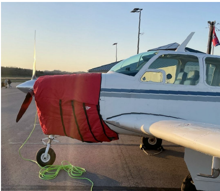
Beech Bonanza S35 Insulated Engine Cover