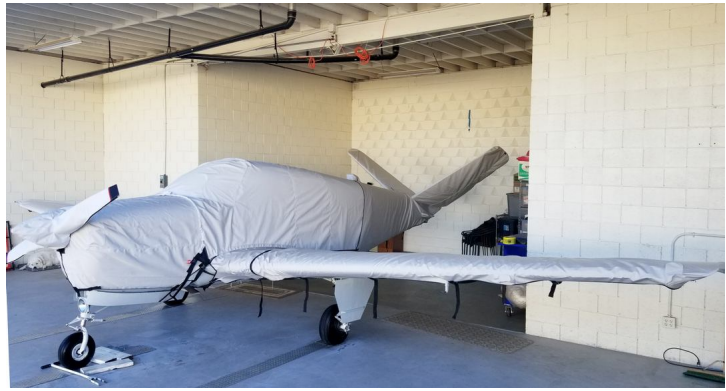
Bonanza N35 Extended Canopy, Engine, Empennage, Wing & Prop Covers