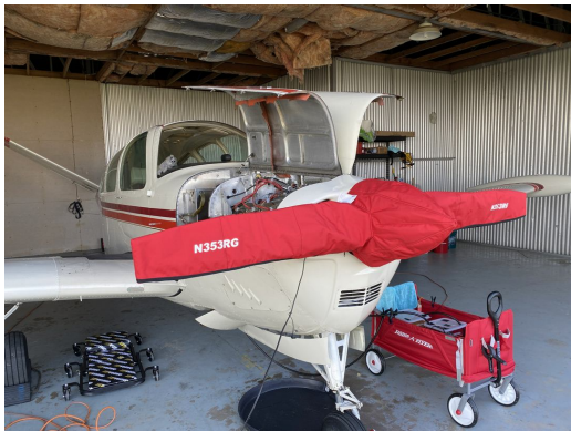
Bonanza D35 Insulated Propellor/Spinner Cover

This cover type is made from Silver Acrylic Sunbrella canvas and is 100% lined with a soft and smooth microfiber. Bruce's Custom Covers developed this material combination especially for aircraft protection. The outer material is medium weight and treated for water resistance, UV resistance and anti-static buildup. The inner lining is a very soft and smooth microfiber to prevent scratching. The material is very reflective, and tests show that the cabin interior temperature can be reduced to near-ambient temperature on the hottest of days. It is water, ice and snow repellent, yet breathable to allow moisture to escape from between the cover and the aircraft surface.