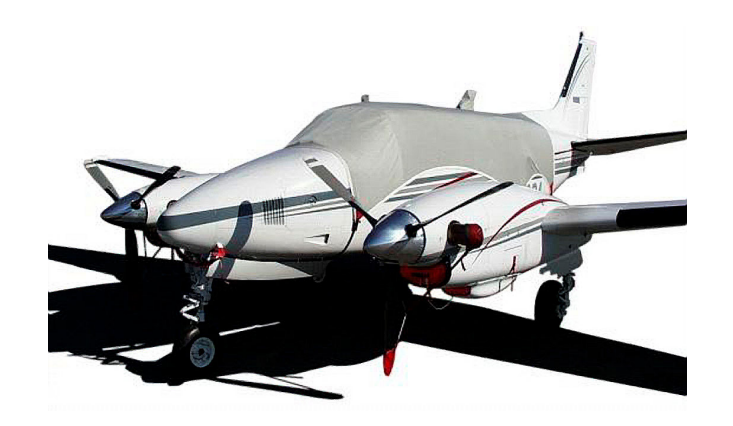
King Air Canopy Cover, Engine Plugs, Prop-Tie/Exhaust Covers