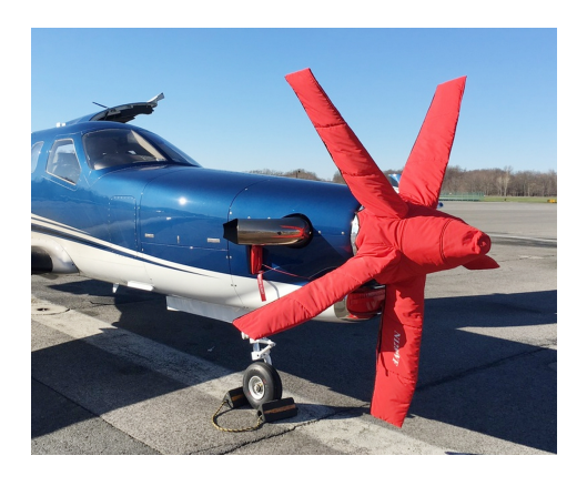
Socata TBM Insulated 5-Blade Prop/Spinner Cover