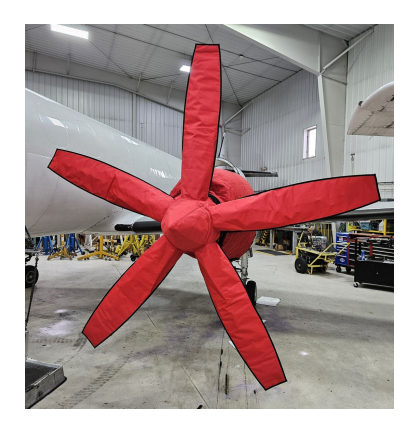
Fairchild Metro 5 Blade Insulated Insulated Prop Covers