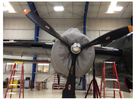
B25 Engine Cover