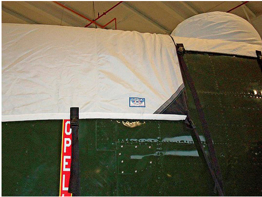
B25 Gun Turret Cover