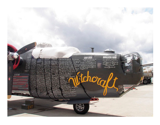
Cockpit/Gun Turret Cover