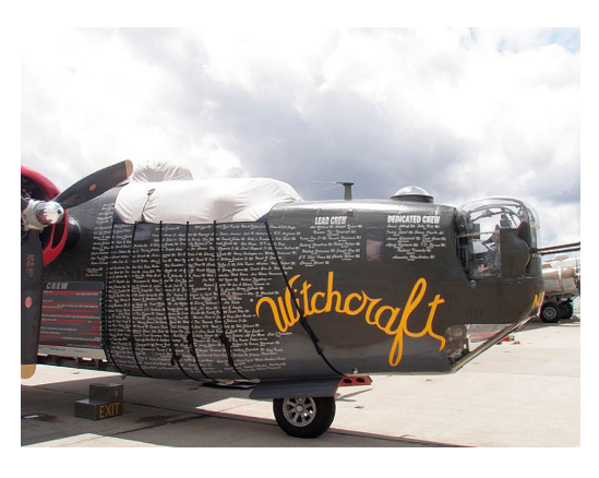
Cockpit/Gun Turret Cover