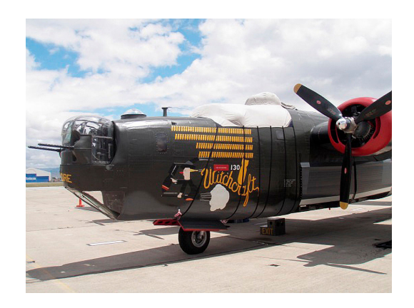
Cockpit/Gun Turret Cover