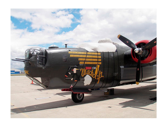
Cockpit/Gun Turret Cover