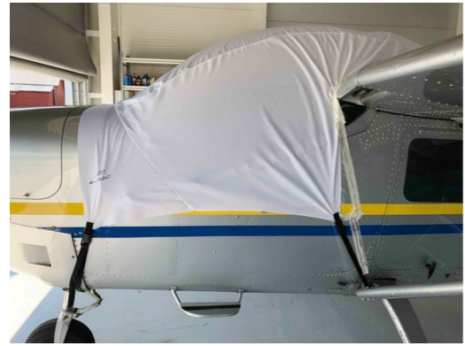
Saab Safari Canopy Cover, test fit cover