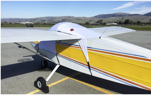
Bolkow Junior 208 Canopy Cover (test fit)