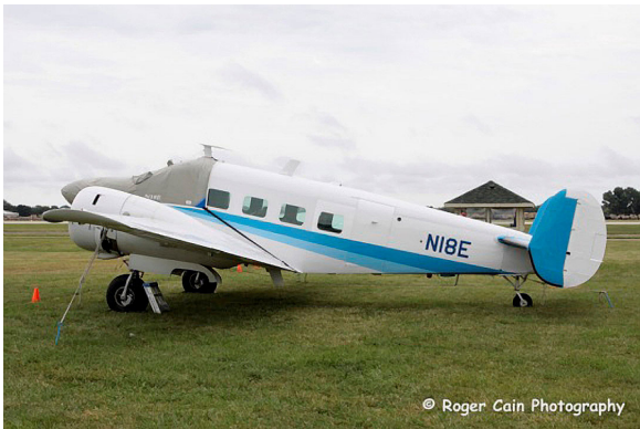
Twin Beech 18 Cockpit/Nose Cover