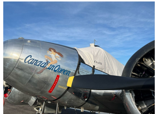
Beech B18 Cockpit Cover