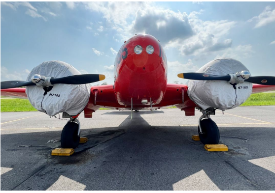
Beech 18 Engine Covers, non-insulated