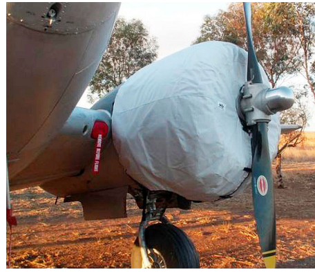
Beech D-18 Engine Covers, Center Section Oil Cooler Inlet Plugs, and Pitot Covers