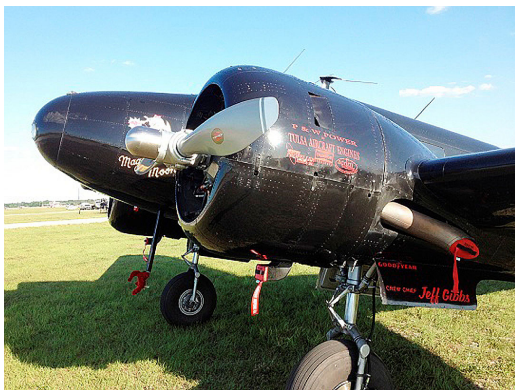
Beech 18 Exhaust & Carb Inlet plugs & Pitot Covers