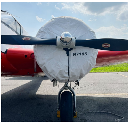
Beech 18 Engine Covers, non-insulated