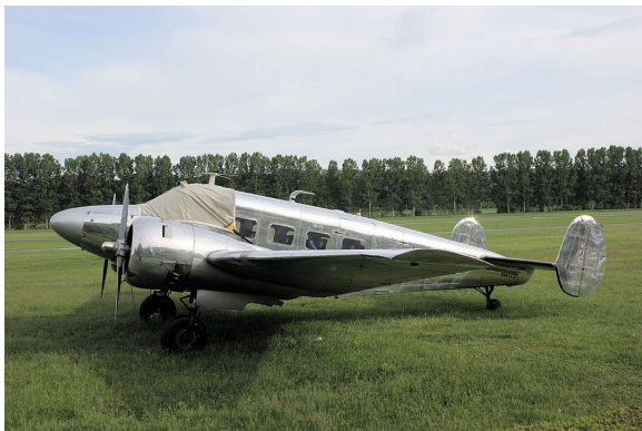
Twin Beech 18 Cockpit Cover

This cover type is made from Silver Acrylic Sunbrella canvas and is 100% lined with a soft and smooth microfiber. Bruce's Custom Covers developed this material combination especially for aircraft protection. The outer material is medium weight and treated for water resistance, UV resistance and anti-static buildup. The inner lining is a very soft and smooth microfiber to prevent scratching. The material is very reflective, and tests show that the cabin interior temperature can be reduced to near-ambient temperature on the hottest of days. It is water, ice and snow repellent, yet breathable to allow moisture to escape from between the cover and the aircraft surface.