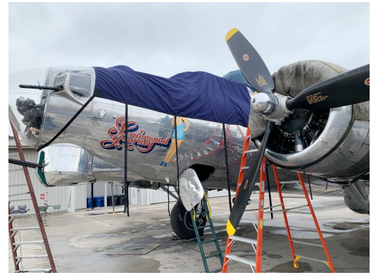
Boeing B-17 Canopy Cover