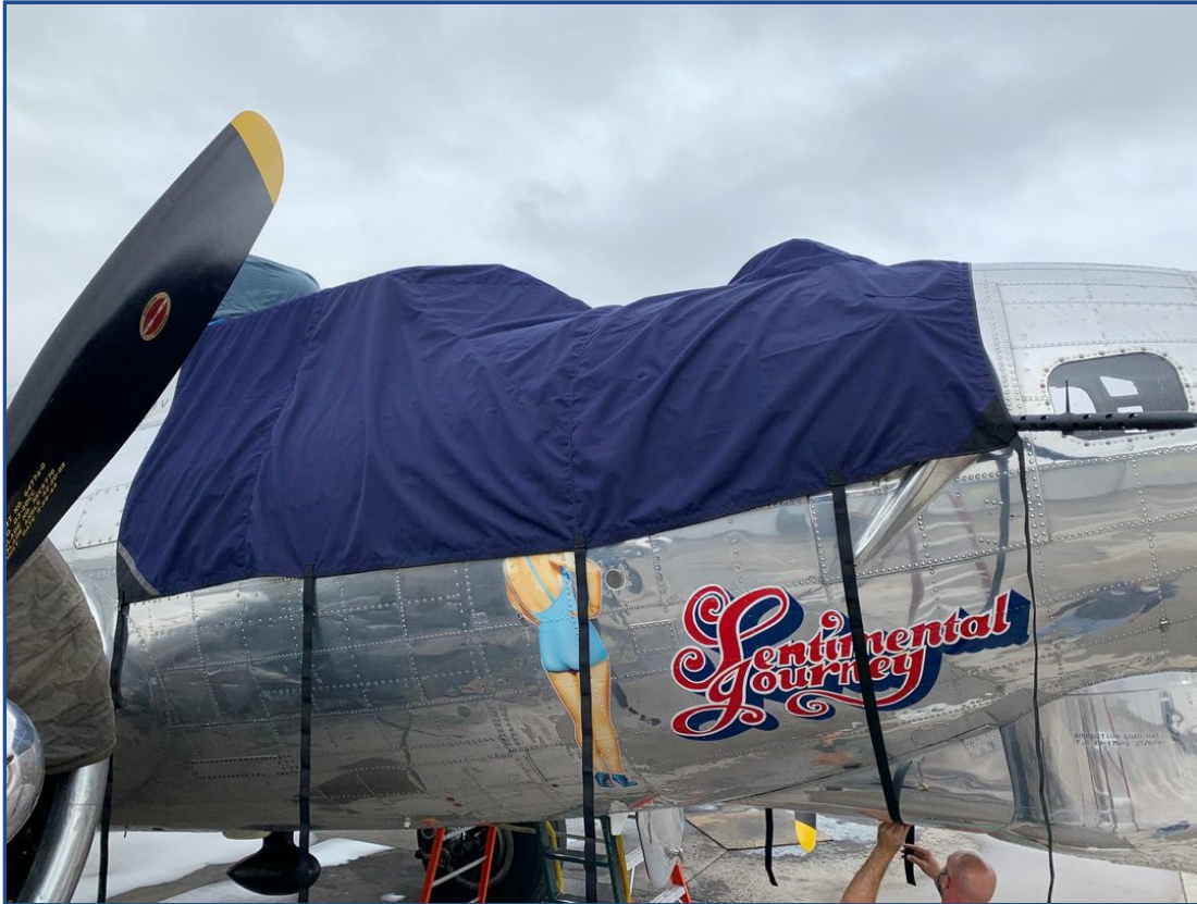
Boeing B-17 Canopy Cover