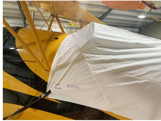
Bucher BU-133 Jungmeister Canopy Cover, test fit cover