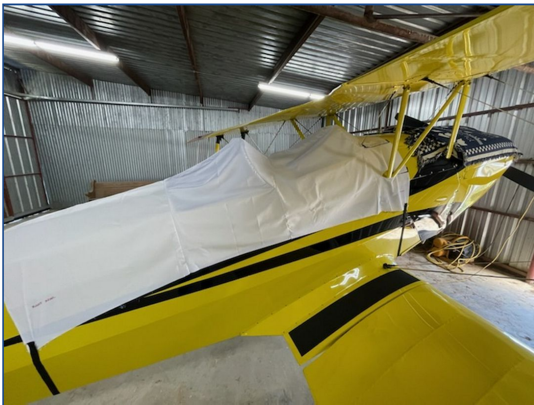
Bucker Jungmann BU-131 Canopy Cover, test fit cover