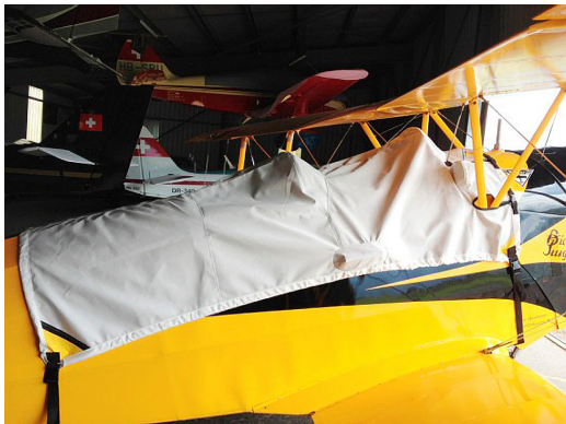
Bucker Jungmann Canopy Cover

the hottest of days. It is water, ice and snow repellent, yet breathable to allow moisture to escape from between the cover and the aircraft surface.