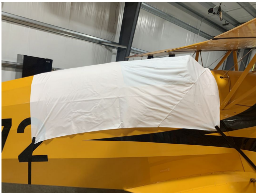
Bucher BU-133 Jungmeister Canopy Cover, test fit cover