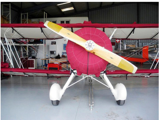
Waco UPF-7 Engine Cover