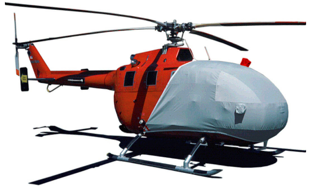
MBB BO-105 Bubble Cover