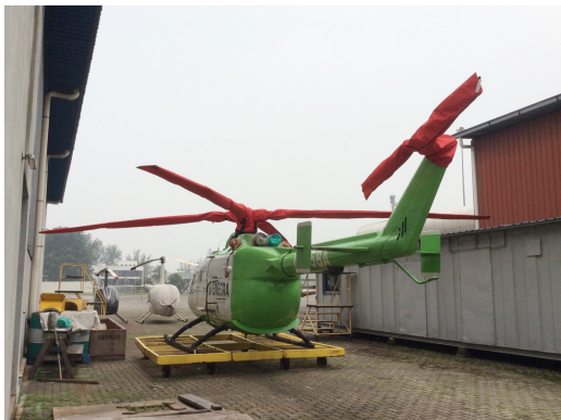
MBB BO-105 Blade, Rotor Head & Tail Rotor Covers

WINTER USE MATERIAL - Made with Solution-Dyed Polyester fabric, this option is intended for seasonal use to aid in deicing, rain mitigation, or for occasional travel. The material is lighter and more compact, but more susceptible to UV damage and may have a shorter useful life if used continuously outside than the all-year use material.