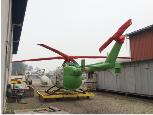
MBB BO-105 Blade, Rotor Head & Tail Rotor Covers

WINTER USE MATERIAL - Made with Solution-Dyed Polyester fabric, this option is intended for seasonal use to aid in deicing, rain mitigation, or for occasional travel. The material is lighter and more compact, but more susceptible to UV damage and may have a shorter useful life if used continuously outside than the all-year use material.