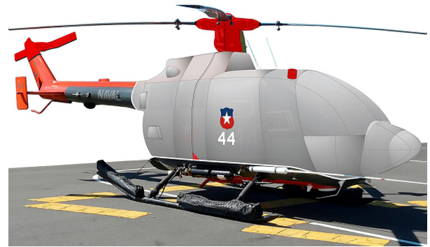
MBB BO-105 Full Body, Rotor Mast & Tail Rotor Covers (illustration)