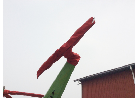
MBB BO-105 Tail Rotor Covers