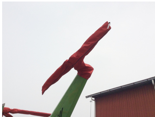
MBB BO-105 Tail Rotor Covers