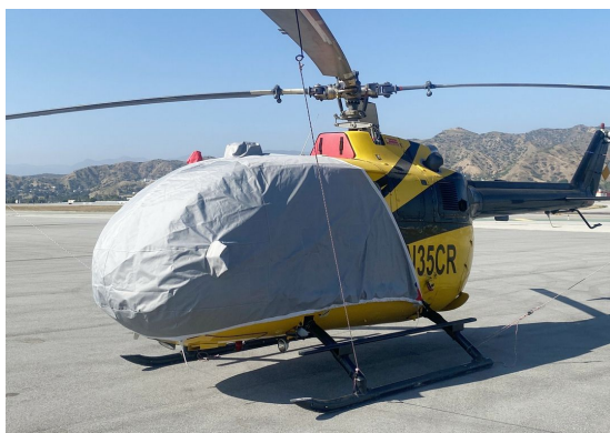
Eurocopter BO-105 Bubble Cover, Standard Model