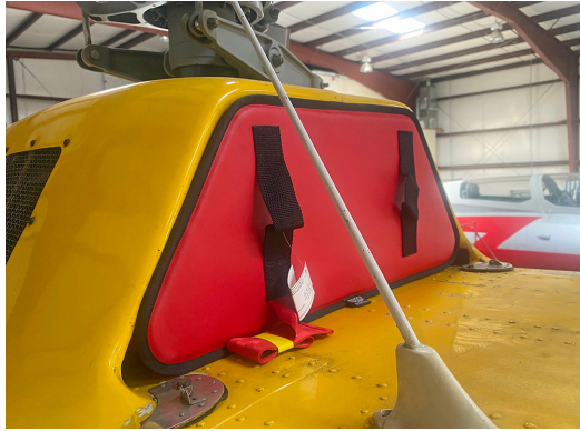
BO 105CB Intake Plug

The Engine Inlet Plugs are custom fit for your Eurocopter BO-105 intakes, made with heavy-duty vinyl material, and stuffed with a single block of sculpted urethane foam. Each plug has a zipper that allows the foam to be removed and dried if necessary. Engine plugs have 'Remove Before Flight' streamers sewn onto the face of the plugs. Most plugs are imprinted with the aircraft registration number in black for an extra charge. Storage bag NOT included. Engine plugs may be inserted after flight when the engine is still warm. Engine Inlet Plugs are commonly referred to as Cowl Plugs, Intake Plugs, Cowl Blocks, Engine Blocks, and Engine Bungs.