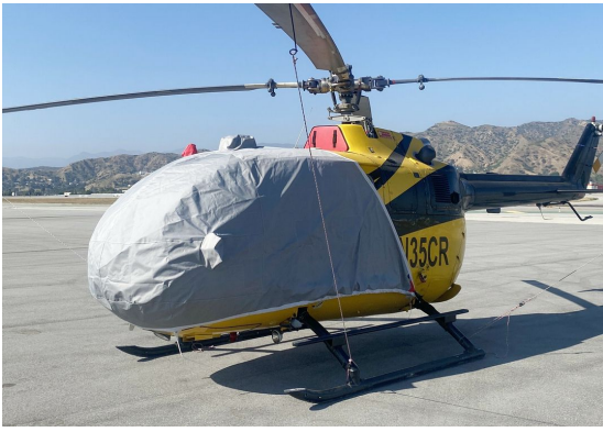
Eurocopter BO-105 Bubble Cover, Standard Model