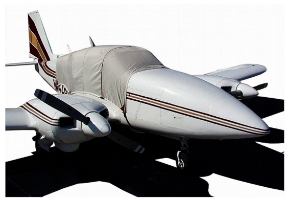
Aztec Canopy Cover