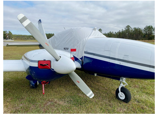
Piper PA-23-250 Aztec Inlet plugs