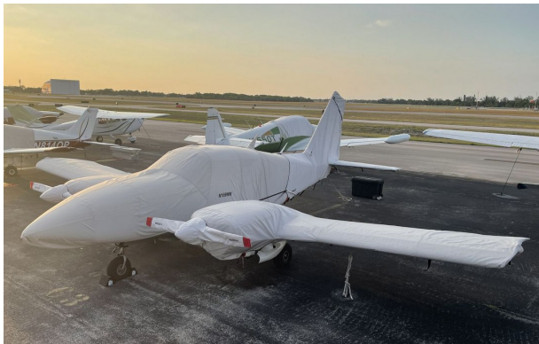
Piper Aztec Complete Cover Set

WINTER USE MATERIAL - Made with Solution-Dyed Polyester fabric, this option is intended for seasonal use to aid in deicing, rain mitigation, or for occasional travel. The material is lighter and more compact, but more susceptible to UV damage and may have a shorter useful life if used continuously outside than the all-year use material.