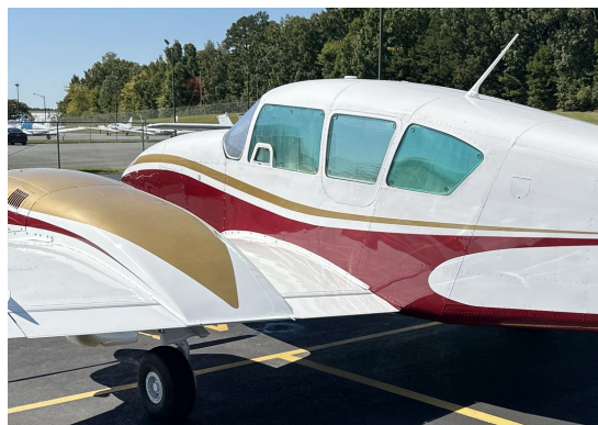
Piper Aztec HeatShields