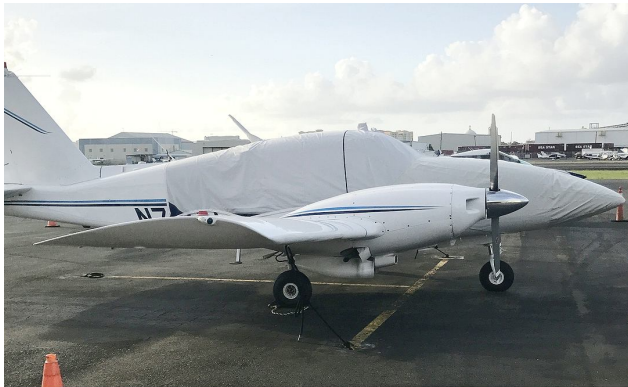
Piper Aztec Canopy/Nose Cover

Travel Covers are made with Silver Solution-Dyed Polyester fabric and only lined over the windshield to save weight. The material is lightweight and more compact for easy stowage in the aircraft. The polyester material is water resistant, but only intended for occasional use outside. We also have an ultra lightweight material available for fitted hangar dust covers. For daily outdoor use, the non-travel Sunbrella Cover is the best choice.