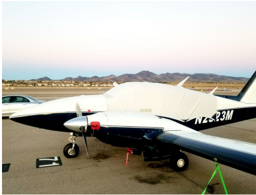
Piper Aztec Canopy Cover & Engine Plugs

are imprinted with the aircraft registration number in black for an extra charge. Storage bag NOT included. Engine plugs may be inserted after flight when the engine is still warm. Engine Inlet Plugs are commonly referred to as Cowl Plugs, Intake Plugs, Cowl Blocks, Engine Blocks, and Engine Bungs.