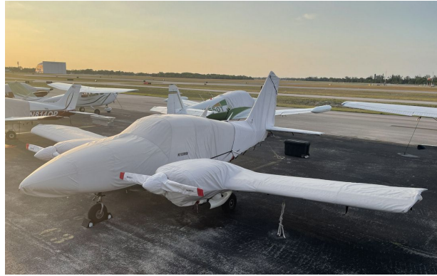
Piper Aztec Complete Cover Set