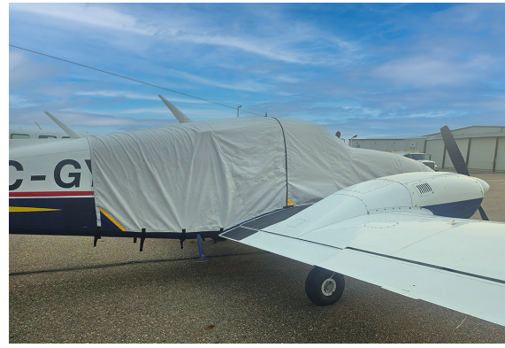
PA-23 Aztec Extended Canopy/Nose Cover, E & F Models