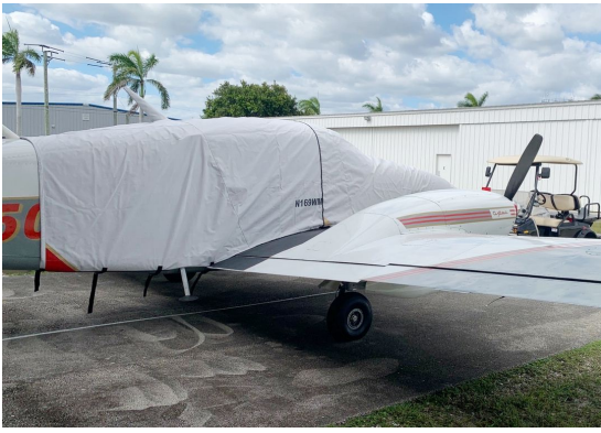
Piper Aztec Extended Canopy/Nose Cover