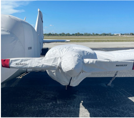
Piper Aztec Propellor Cover

This cover type is made from Silver Acrylic Sunbrella canvas and is 100% lined with a soft and smooth microfiber. Bruce's Custom Covers developed this material combination especially for aircraft protection. The outer material is medium weight and treated for water resistance, UV resistance and anti-static buildup. The inner lining is a very soft and smooth microfiber to prevent scratching. The material is very reflective, and tests show that the cabin interior temperature can be reduced to near-ambient temperature on the hottest of days. It is water, ice and snow repellent, yet breathable to allow moisture to escape from between the cover and the aircraft surface.