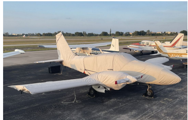
Piper Aztec Complete Cover Set