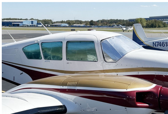
Piper Aztec HeatShields

Windshield Heatshields are interior sunshades for an aircraft's front windshield. The product is a unique composite of closed-cell foam with a silver mylar finish. The semi-rigid design is stiff enough to stand along the inside of the windshield using sun visors or window framing. It folds up flat and easily stores in the included storage sleeve. Some designs may require velcro and suction cups or split right and left sides. A Heatshield is an excellent short-term remedy for cockpit overheating. An external fabric cover is far more effective and practical for long-term protection.