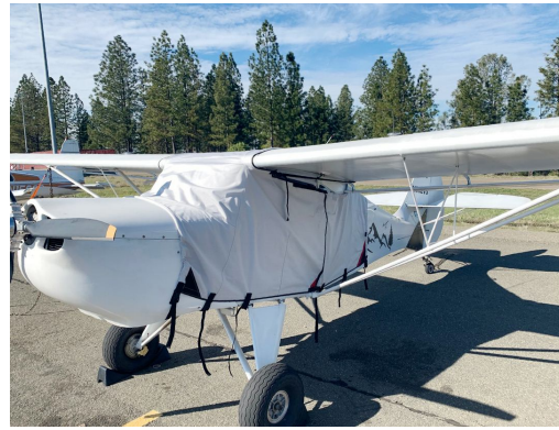
Avid Heavy Hauler MK 4 Over The Top Style Canopy Cover