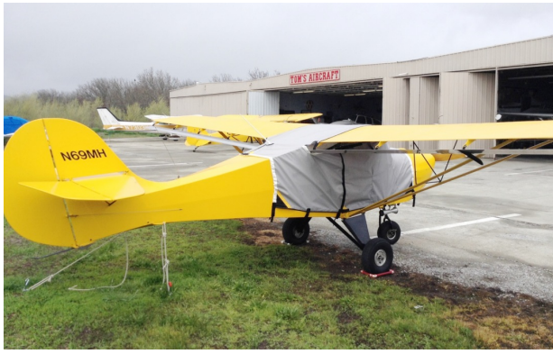
Avid Flyer Extended Canopy Cover