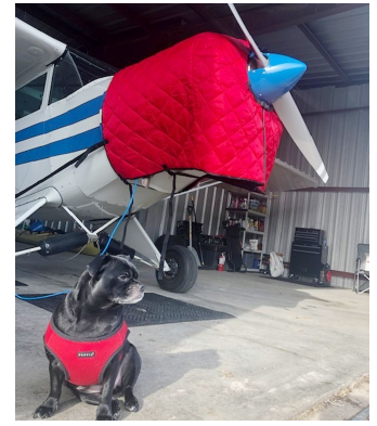
Piper PA-12 Insulated Hangar Blanket