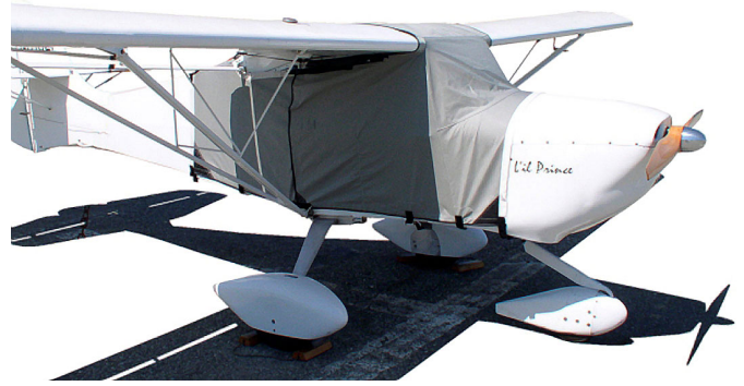
Avid Flyer Extended Canopy Cover