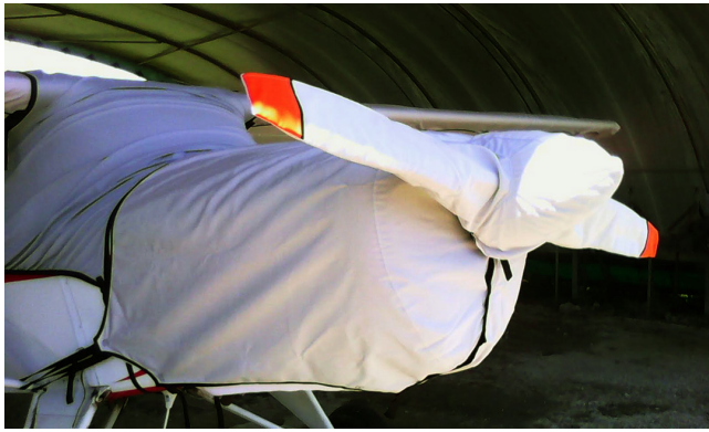
Auster J5 Canopy, Engine, and Propellor Covers