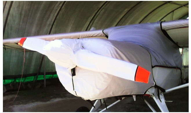
Auster J5 Canopy, Engine, and Propellor Covers