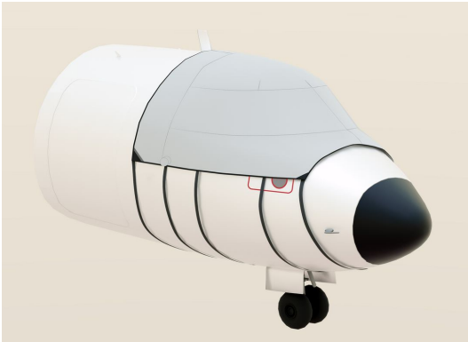
Aerospatiale ATR-42/72 Cockpit Cover, 3D model