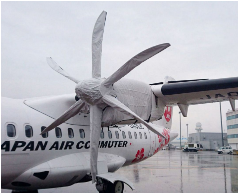
ATR-42/72 Engine Cover, 6-Blade Prop/Spinner Cover

water resistance, UV resistance and anti-static buildup. The inner lining is a very soft and smooth microfiber to prevent scratching. The material is very reflective, and tests show that the cabin interior temperature can be reduced to near-ambient temperature on the hottest of days. It is water, ice and snow repellent, yet breathable to allow moisture to escape from between the cover and the aircraft surface.