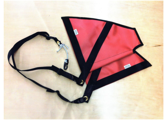
Aerospatale ATR-42/72 Prop Tie-Downs