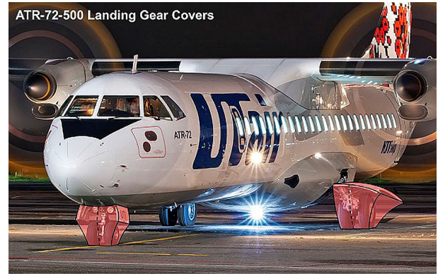
ATR 72 Landing Gear/Tire Covers