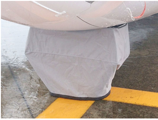
ATR-42/72 Nose Gear Landing Gear/Tire Covers