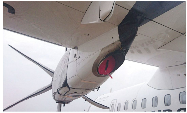
ATR-42/72 Exhaust Plugs