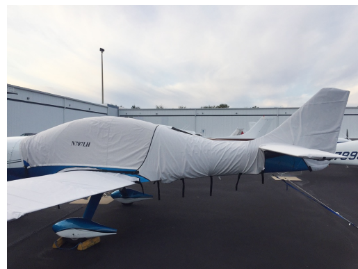
Lancair ES Wing Covers & Empennage Cover (sold separately)