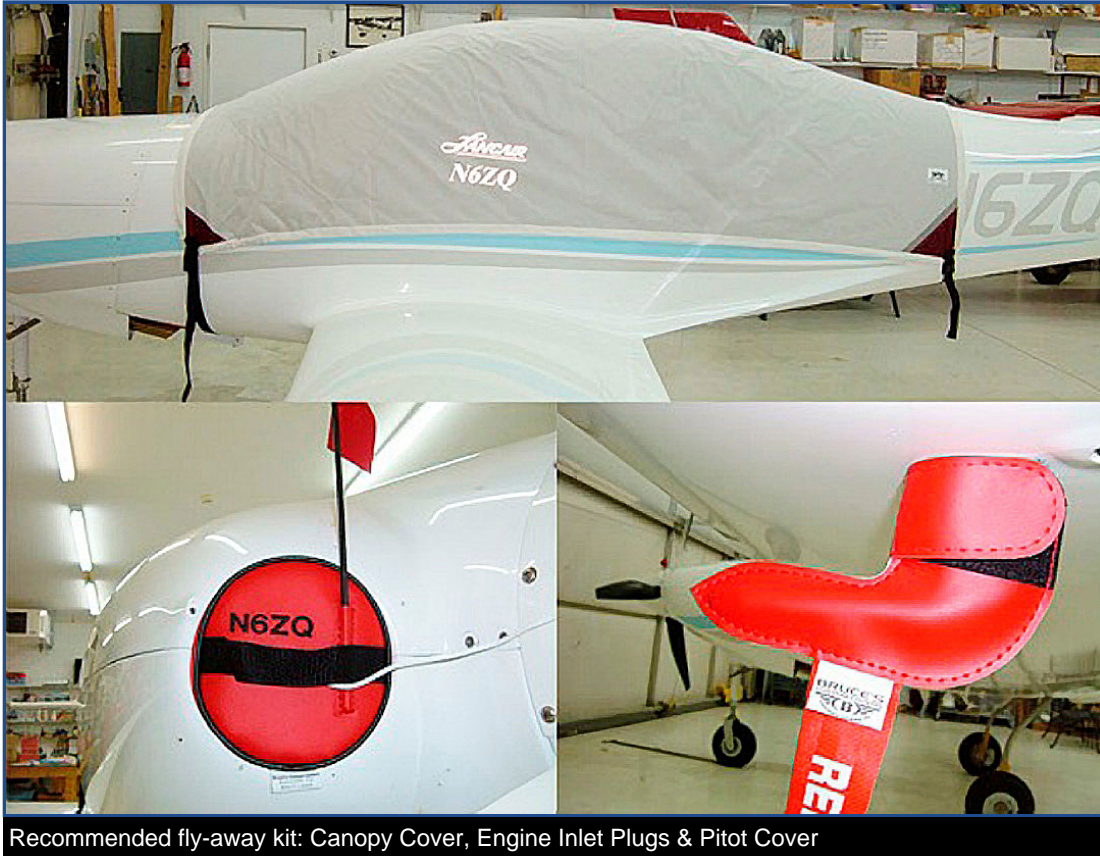
Recommended fly-away kit: Canopy Cover, Engine Inlet Plugs &amp; Pitot Cover