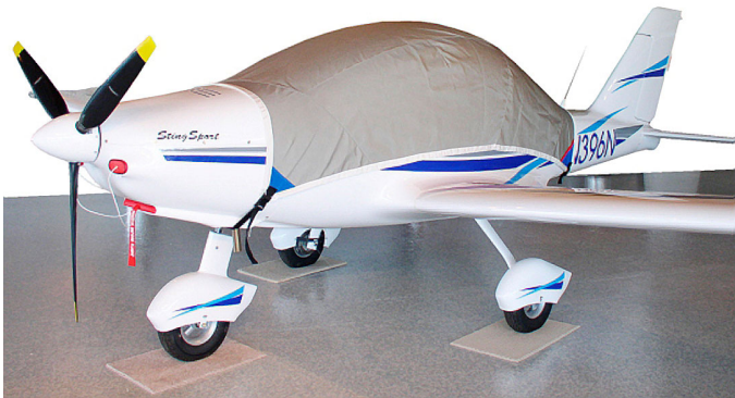
Sting Sport Canopy Cover & Engine Plugs