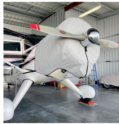
Stinson Reliant V-77, SR, AT-19 Insulated Engine Cover