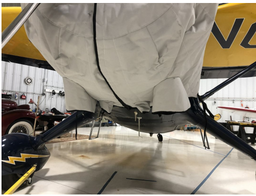
Stinson Reliant SR-10 Insulated Engine Cover