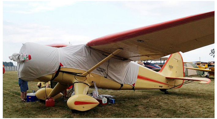
Stinson Reliant Over-the-top Canopy Cover and Engine Cover Stinson Reliant Over-the-top Canopy, Engine & Propellor Covers