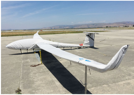
Schemp-Hirth Discus 2B Full Cover Set