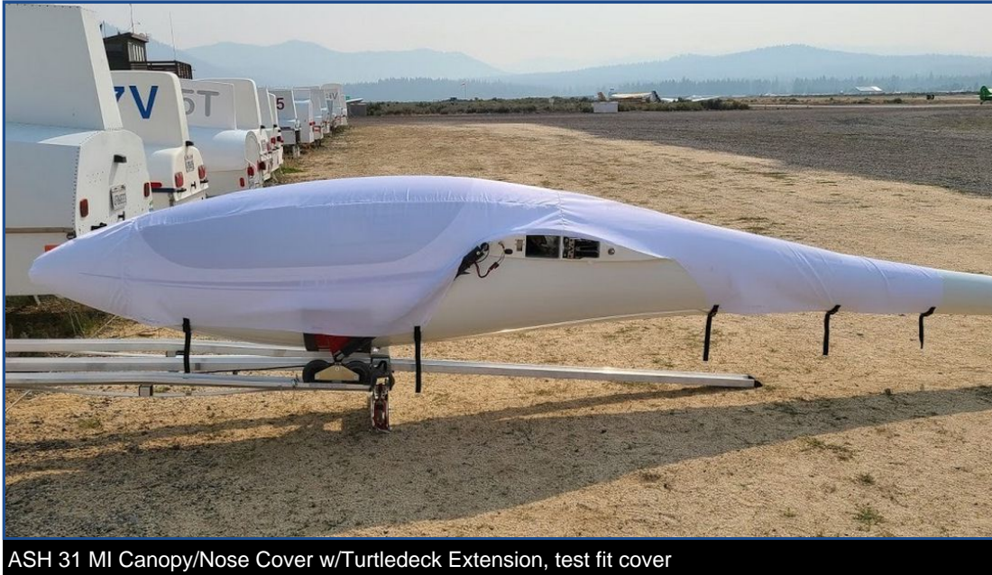
ASH 31 MI Canopy/Nose Cover w/Turtledeck Extension, test fit cover