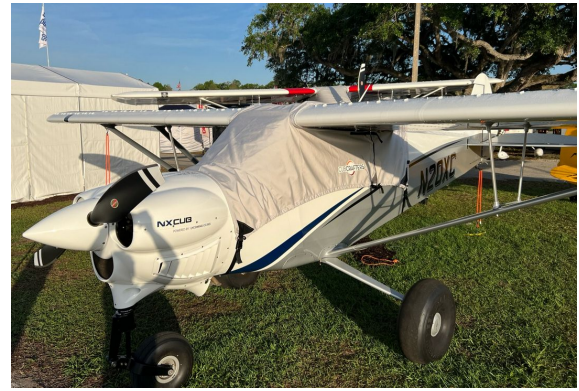
Cub Crafters CC-18 Canopy Cover