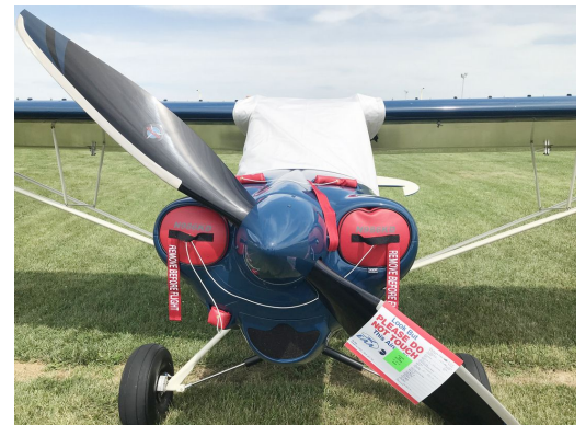
Cubcrafters CC-18 Engine Inlet Plugs