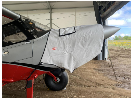
Cub Crafters CC-19 Engine Cover