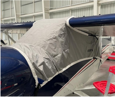
CubCrafters CCX-2300 Light Weight Travel Cover

Travel Covers are made with Silver Solution-Dyed Polyester fabric and only lined over the windshield to save weight. The material is lightweight and more compact for easy stowage in the aircraft. The polyester material is water resistant, but only intended for occasional use outside. We also have an ultra lightweight material available for fitted hangar dust covers. For daily outdoor use, the non-travel Sunbrella Cover is the best choice.