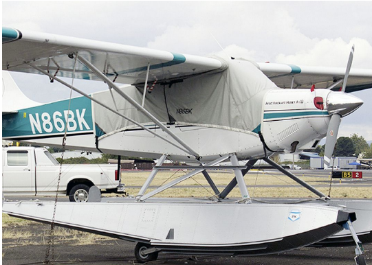
Aviat Husky Canopy Cover and Inlet Plugs

Engine Inlet Plugs are custom fit for your Normand Dube Aerocruiser intakes, made with heavy-duty vinyl material, and stuffed with a single block of sculpted urethane foam. Each plug has a zipper that allows the foam to be removed and dried if necessary. Engine plugs have warning flags that are visible from the cockpit or 'remove before flight' streamers sewn onto the face of the plugs. Most plugs are imprinted with the aircraft registration number in black for an extra charge. Storage bag NOT included. Engine plugs may be inserted after flight when the engine is still warm. Engine Inlet Plugs are commonly referred to as Cowl Plugs, Intake Plugs, Cowl Blocks, Engine Blocks, and Engine Bungs.