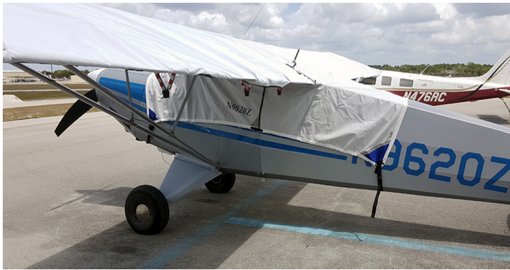
Aviat (Christen) Husky Wing Covers, All Year Use

This cover type is made from Silver Acrylic Sunbrella canvas and is 100% lined with a soft and smooth microfiber. Bruce's Custom Covers developed this material combination especially for aircraft protection. The outer material is medium weight and treated for water resistance, UV resistance and anti-static buildup. The inner lining is a very soft and smooth microfiber to prevent scratching. The material is very reflective, and tests show that the cabin interior temperature can be reduced to near-ambient temperature on the hottest of days. It is water, ice and snow repellent, yet breathable to allow moisture to escape from between the cover and the aircraft surface.