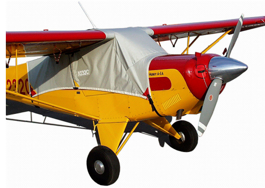
Aviat Husky Canopy Cover & Engine Plugs