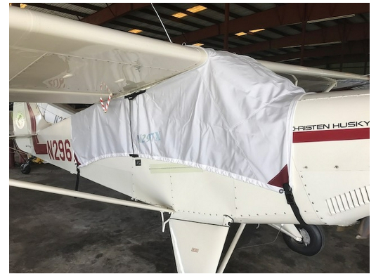
Aviat Husky Canopy Cover