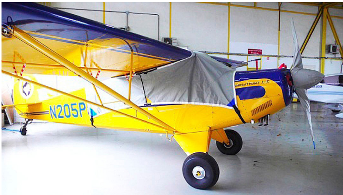
Aviat Husky Canopy & Prop Covers

This cover type is made from Silver Acrylic Sunbrella canvas and is 100% lined with a soft and smooth microfiber. Bruce's Custom Covers developed this material combination especially for aircraft protection. The outer material is medium weight and treated for water resistance, UV resistance and anti-static buildup. The inner lining is a very soft and smooth microfiber to prevent scratching. The material is very reflective, and tests show that the cabin interior temperature can be reduced to near-ambient temperature on the hottest of days. It is water, ice and snow repellent, yet breathable to allow moisture to escape from between the cover and the aircraft surface.