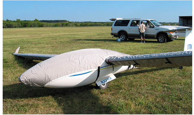
Canopy/Nose Cover, Wings and Horizontal Stab Covers