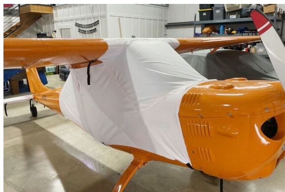
Aeromarine Merlin Over-Top Canopy Cover, test fit cover