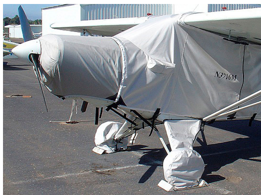
Piper PA-12 Landing Gear Covers

ALL-YEAR USE MATERIAL - Made with Silver Acrylic Sunbrella canvas, the all-year use material is the best option for sun protection and cover longevity. This heavier more durable material is intended for all weather conditions, such as rain and snow or lots of sun.