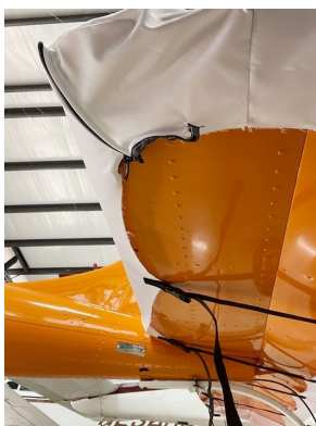
Aeromarine Merlin Horizontal Stabilizer Covers, test fit covers