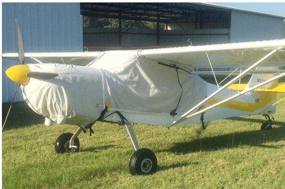
Kitfox Canopy & Engine Cover

This cover type is made from Silver Acrylic Sunbrella canvas and is 100% lined with a soft and smooth microfiber. Bruce's Custom Covers developed this material combination especially for aircraft protection. The outer material is medium weight and treated for water resistance, UV resistance and anti-static buildup. The inner lining is a very soft and smooth microfiber to prevent scratching. The material is very reflective, and tests show that the cabin interior temperature can be reduced to near-ambient temperature on the hottest of days. It is water, ice and snow repellent, yet breathable to allow moisture to escape from between the cover and the aircraft surface.