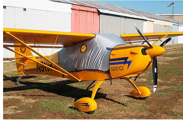
Aerotrek A220 Fitted Hangar Dust Cover