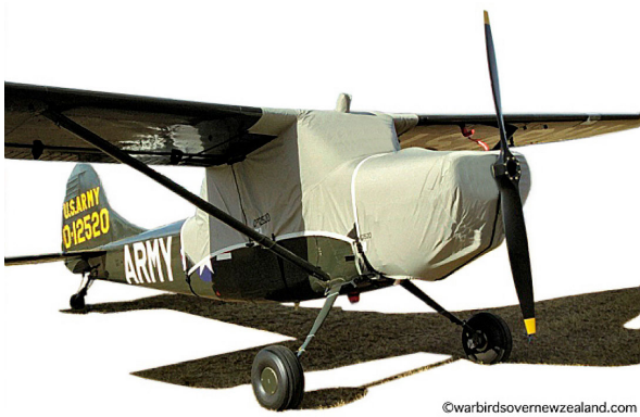
Cessna L-19 Canopy & Engine Covers

the hottest of days. It is water, ice and snow repellent, yet breathable to allow moisture to escape from between the cover and the aircraft surface.