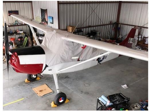
Cessna Bird Dog, L-19, O-1, 305 Canopy Cover, Over-Top Type Cessna Bird Dog, L-19, O-1, 305 Canopy Cover, Over-Top Type