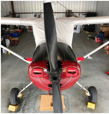
Cessna Bird Dog, L-19, O-1, 305 Engine Inlet Plugs