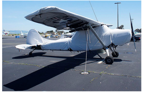
Wing Covers on Cessna Bird Dog