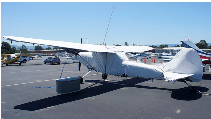
Cessna L-19 Extended Over-the-top Canopy, Engine, Empennage & Wing Covers