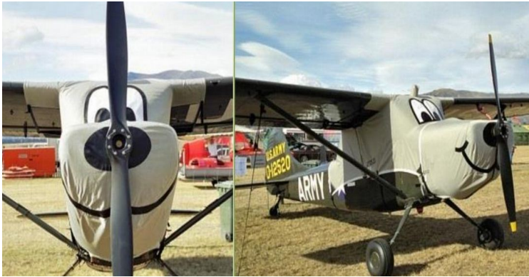
Cessna L-19 Bird Dog Canopy Cover, Engine Cover