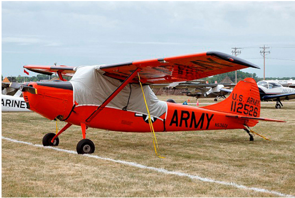
Cessna L-19 Bird Dog Canopy Cover