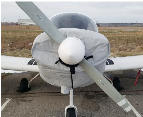
Alarus CH-2000 Insulated Engine Cover

This cover type is made from Silver Acrylic Sunbrella canvas and is 100% lined with a soft and smooth microfiber. Bruce's Custom Covers developed this material combination especially for aircraft protection. The outer material is medium weight and treated for water resistance, UV resistance and anti-static buildup. The inner lining is a very soft and smooth microfiber to prevent scratching. The material is very reflective, and tests show that the cabin interior temperature can be reduced to near-ambient temperature on the hottest of days. It is water, ice and snow repellent, yet breathable to allow moisture to escape from between the cover and the aircraft surface.