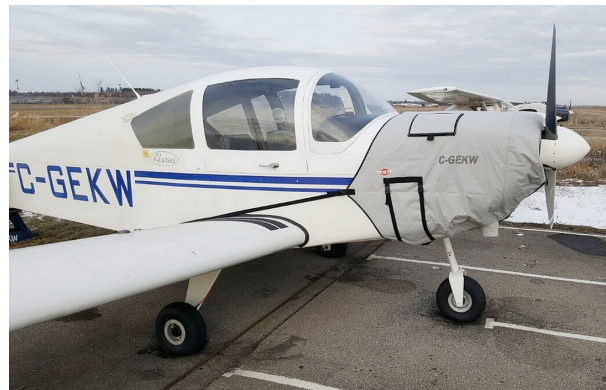
Alarus CH-2000 Insulated Engine Cover