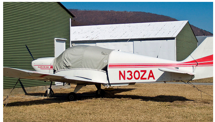
Alarus CH2000 Canopy Cover