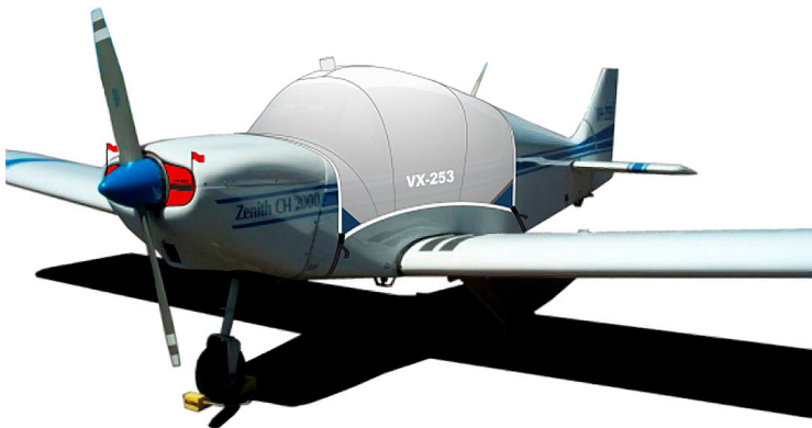
AMD Alarus CH2000 Std Canopy Cover & Engine Plugs (Illustration)

This cover type is made from Silver Acrylic Sunbrella canvas and is 100% lined with a soft and smooth microfiber. Bruce's Custom Covers developed this material combination especially for aircraft protection. The outer material is medium weight and treated for water resistance, UV resistance and anti-static buildup. The inner lining is a very soft and smooth microfiber to prevent scratching. The material is very reflective, and tests show that the cabin interior temperature can be reduced to near-ambient temperature on the hottest of days. It is water, ice and snow repellent, yet breathable to allow moisture to escape from between the cover and the aircraft surface.