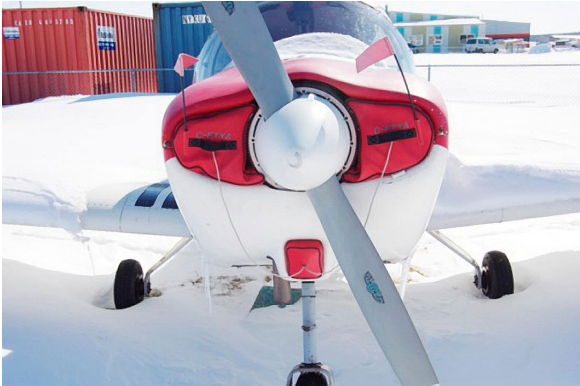
Alarus CH2000 Engine Plugs

Engine Inlet Plugs are custom fit for your Aircraft Mfg. & Development Alarus CH2000 intakes, made with heavy-duty vinyl material, and stuffed with a single block of sculpted urethane foam. Each plug has a zipper that allows the foam to be removed and dried if necessary. Engine plugs have warning flags that are visible from the cockpit or 'remove before flight' streamers sewn onto the face of the plugs. Most plugs are imprinted with the aircraft registration number in black for an extra charge. Storage bag NOT included. Engine plugs may be inserted after flight when the engine is still warm. Engine Inlet Plugs are commonly referred to as Cowl Plugs, Intake Plugs, Cowl Blocks, Engine Blocks, and Engine Bungs.