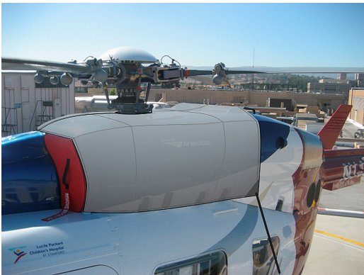
Upper Deck Plugs/Cover, extended to cover aft intake vents

The Engine Inlet Plugs are custom fit for your Airbus Helicopter UH-72A intakes, made with heavy-duty vinyl material, and stuffed with a single block of sculpted urethane foam. Each plug has a zipper that allows the foam to be removed and dried if necessary. Engine plugs have 'Remove Before Flight' streamers sewn onto the face of the plugs. Most plugs are imprinted with the aircraft registration number in black for an extra charge. Storage bag NOT included. Engine plugs may be inserted after flight when the engine is still warm. Engine Inlet Plugs are commonly referred to as Cowl Plugs, Intake Plugs, Cowl Blocks, Engine Blocks, and Engine Bunges.