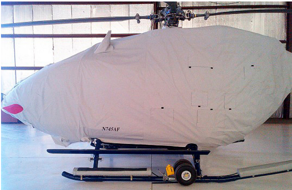
Eurocopter EC-145 Main Body Cover, also covers the bottom belly