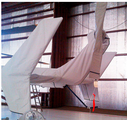
Tail Rotor Cover & Tailboom, Vertical Pylon & Stabilizers Cover

The Tailboom Cover details vary by model, but generally the helicopter tail boom cover encloses the tail boom from the "bottleneck" to the aft end. They usually also cover the horizontal stabilizers, and are custom made to allow for antennae, lights, and other protrusions. They attach with straps underneath the tail boom. Covers for the vertical and horizontal stabilizers are also available separately. Specific information for each model is available on request.