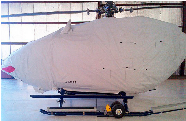
Eurocopter EC-145 Main Body Cover, also covers the bottom belly