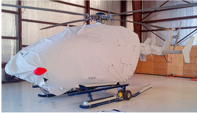
Main Body (also covers bottom), Tailboom, Vertical Pylon, Stabilizers and Tail Rotor Covers

Covers developed this material combination especially for aircraft protection. The outer material is medium weight and treated for water resistance, UV resistance and anti-static buildup. The inner lining is a very soft and smooth microfiber to prevent scratching. The material is very reflective, and tests show that the cabin interior temperature can be reduced to near-ambient temperature on the hottest of days. It is water, ice and snow repellent, yet breathable to allow moisture to escape from between the cover and the aircraft surface.