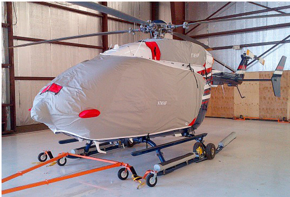
Bubble Cover w/ nose mounted radome & Upper Deck Plugs/Cover

Covers developed this material combination especially for aircraft protection. The outer material is medium weight and treated for water resistance, UV resistance and anti-static buildup. The inner lining is a very soft and smooth microfiber to prevent scratching. The material is very reflective, and tests show that the cabin interior temperature can be reduced to near-ambient temperature on the hottest of days. It is water, ice and snow repellent, yet breathable to allow moisture to escape from between the cover and the aircraft surface.