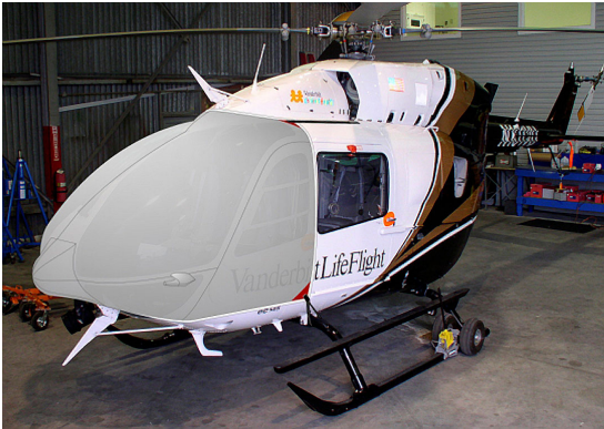
EC-145 Windshield/Nose Cover (illustration)