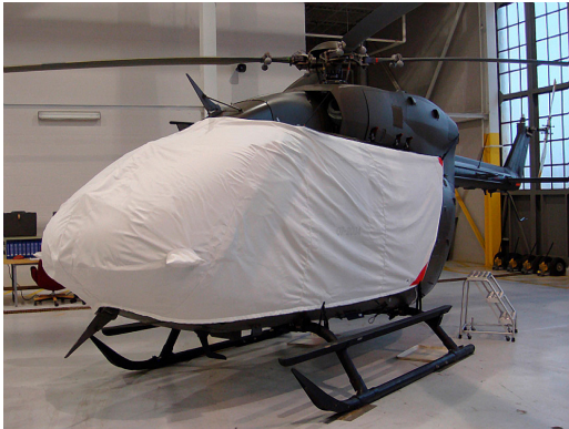
EC-145 Bubble Cover

This cover type is made from Silver Acrylic Sunbrella canvas and is 100% lined with a soft and smooth microfiber. Bruce's Custom Covers developed this material combination especially for aircraft protection. The outer material is medium weight and treated for water resistance, UV resistance and anti-static buildup. The inner lining is a very soft and smooth microfiber to prevent scratching. The material is very reflective, and tests show that the cabin interior temperature can be reduced to near-ambient temperature on the hottest of days. It is water, ice and snow repellent, yet breathable to allow moisture to escape from between the cover and the aircraft surface.