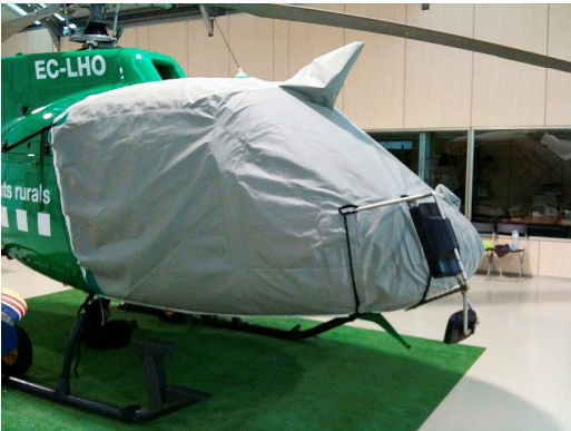
Bubble Cover, Intake/Exhaust, Rotor Mast, Tail Rotor & Main Body Covers AS350 Bubble Cover with Wire Strike and Cargo Mirror