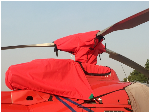
Airbus H-125 & Aerospatiale AS350 Intake/Exhaust Cover, Main Rotor Hub Cover with Weighted Skirt

WINTER USE MATERIAL - Made with Solution-Dyed Polyester fabric, this option is intended for seasonal use to aid in deicing, rain mitigation, or for occasional travel. The material is lighter and more compact, but more susceptible to UV damage and may have a shorter useful life if used continuously outside than the all-year use material.