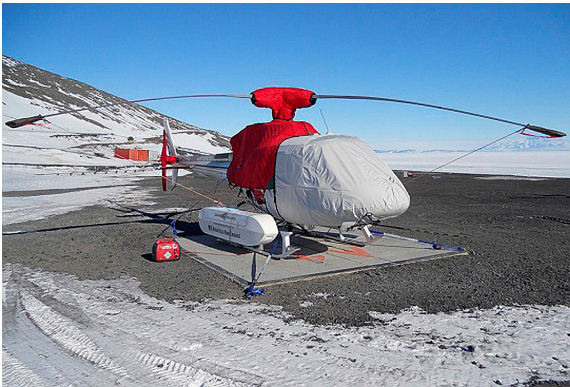
AS350 Bubble Cover w/ Cargo Mirror, Blade Tie-downs, Insulated Engine, Insulated Main Rotor Hub & Insulated Tail Rotor Covers