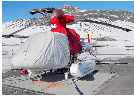
AS350 Bubble Cover w/ Cargo Mirror, Blade Tie-downs, Insulated Engine, Insulated Main Rotor Hub and Insulated Tail Rotor Covers