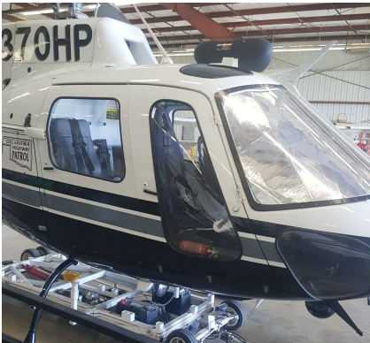
Aerospatiale AS350 Astar, Ecureuil, Esquilo, Fennec Windshield Heatshields

A Heatshield is an excellent short-term remedy for cockpit overheating.