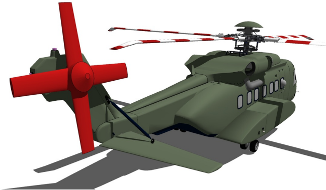
Sikorsky S-92 Tail Rotor Blade and Hub Covers

WINTER USE MATERIAL - Made with Solution-Dyed Polyester fabric, this option is intended for seasonal use to aid in deicing, rain mitigation, or for occasional travel. The material is lighter and more compact, but more susceptible to UV damage and may have a shorter useful life if used continuously outside than the all-year use material.