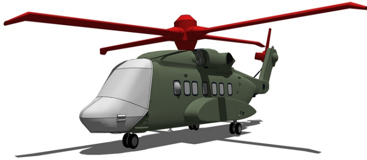
Sikorsky S-92 Windshield/Nose, Blade, Rotor Hub & Tail Rotor Covers

WINTER USE MATERIAL - Made with Solution-Dyed Polyester fabric, this option is intended for seasonal use to aid in deicing, rain mitigation, or for occasional travel. The material is lighter and more compact, but more susceptible to UV damage and may have a shorter useful life if used continuously outside than the all-year use material.