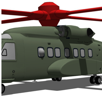
Sikorsky S-92 Main Rotor Hub Cover

WINTER USE MATERIAL - Made with Solution-Dyed Polyester fabric, this option is intended for seasonal use to aid in deicing, rain mitigation, or for occasional travel. The material is lighter and more compact, but more susceptible to UV damage and may have a shorter useful life if used continuously outside than the all-year use material.