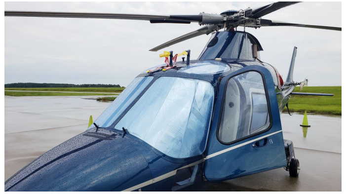
Agusta AW109S/SP Grand Heatshield Set