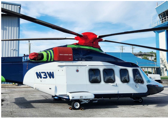
Agusta AW139 Rotor Mast Cover, covers upper deck & aft of rotor mast area