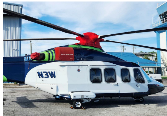
Agusta AW139 Rotor Mast Cover, covers upper deck & aft of rotor mast area