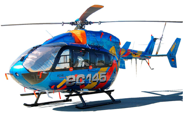
EC-145 Cabin Heatshield Set