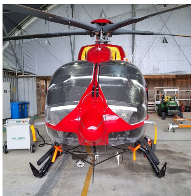
Airbus Helicopter H145D3 Windshield Heatshields, Engine Plugs

Heatshields are interior sunshades for an aircraft's windows or canopy glass. The product is a unique composite of closed-cell foam with a silver mylar finish. The semi-rigid design is stiff enough to stand along the inside of the windshield using sun visors or window framing. It folds up flat and easily stores in the included storage sleeve. Some designs may require velcro and suction cups. A Heatshield is an excellent short-term remedy for cockpit overheating.