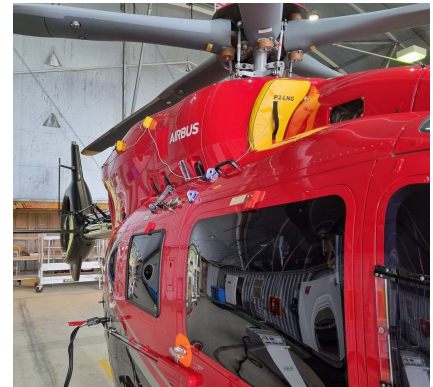
Airbus Helicopter H145D3 Intake Plugs