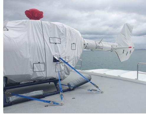
Eurocopter EC-145 D2 Main Body Cover, Tailboom/Fenestron Cover