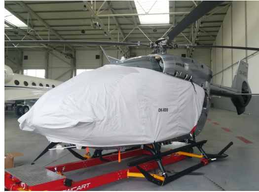
Airbus Helicopter EC-145 Bubble Cover with Radome & Wire Strike