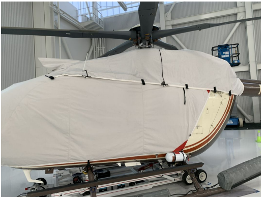
Eurocopter 145 Engine Area Cover, Bubble Cover

The Engine Inlet Plugs are custom fit for your Airbus Helicopter H145, UH-145, BK-117 D-2, D-3 intakes, made with heavy-duty vinyl material, and stuffed with a single block of sculpted urethane foam. Each plug has a zipper that allows the foam to be removed and dried if necessary. Engine plugs have 'Remove Before Flight' streamers sewn onto the face of the plugs. Most plugs are imprinted with the aircraft registration number in black for an extra charge. Storage bag NOT included. Engine plugs may be inserted after flight when the engine is still warm. Engine Inlet Plugs are commonly referred to as Cowl Plugs, Intake Plugs, Cowl Blocks, Engine Blocks, and Engine Bunges.