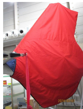
Airbus EC145 Tailfan Housing Fenestron Cover