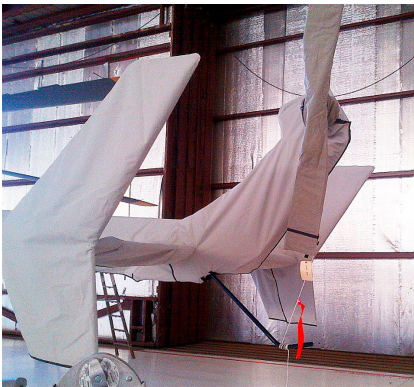
Tail Rotor Cover & Tailboom, Vertical Pylon & Stabilizers Cover