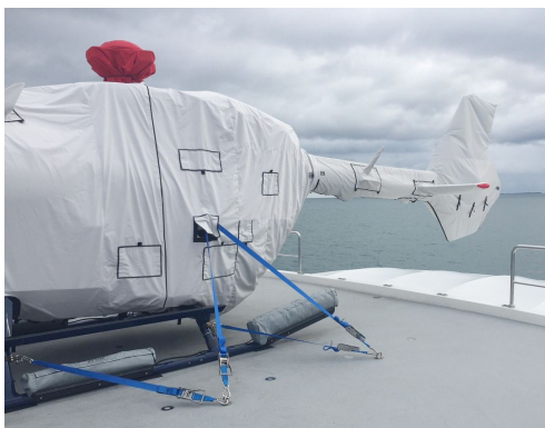
Eurocopter EC-145 D2 Main Body Cover, Tailboom/Fenestron Cover

The Tailboom Cover details vary by model, but generally the helicopter tail boom cover encloses the tail boom from the "bottleneck" to the aft end. They usually also cover the horizontal stabilizers, and are custom made to allow for antennae, lights, and other protrusions. They attach with straps underneath the tail boom. Covers for the vertical and horizontal stabilizers are also available separately. Specific information for each model is available on request.