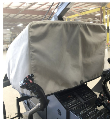
Eurocopter EC-135 Instrument Panel Heatshield Cover