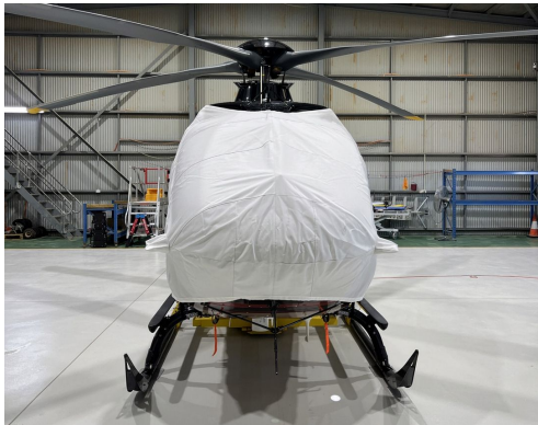
Airbus EC-135 Bubble Cover (with Wire Strike)