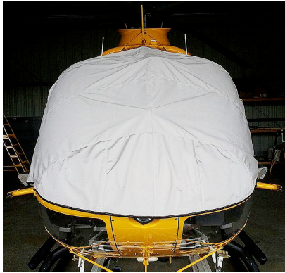
EC-135 Windshield/Skylights Cover, pinches in door jambs