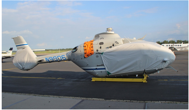
Eurocopter EC-135 Bubble & Tailfan Covers