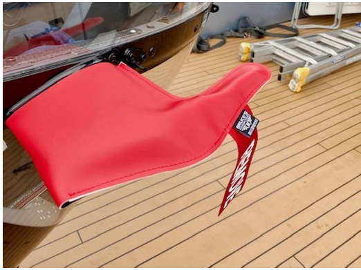
Airbus Helicopter H145 Pitot Tube Cover