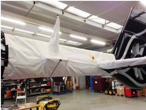
Airbus EC-135 Tailboom/Stabilizer Cover

The Tailboom Cover details vary by model, but generally the helicopter tail boom cover encloses the tail boom from the "bottleneck" to the aft end. They usually also cover the horizontal stabilizers, and are custom made to allow for antennae, lights, and other protrusions. They attach with straps underneath the tail boom. Covers for the vertical and horizontal stabilizers are also available separately. Specific information for each model is available on request.