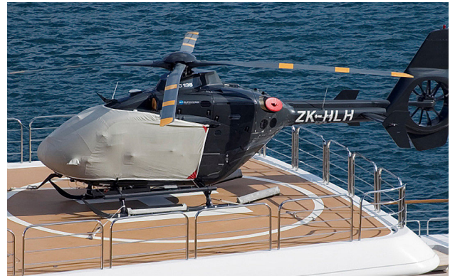
EC-135 Bubble Cover & Exhaust Plugs