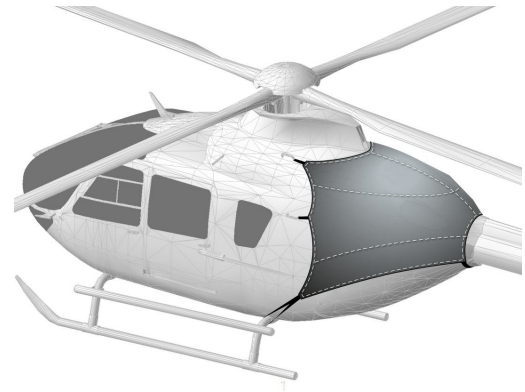
EC135 Exhaust Area Cover, illustration