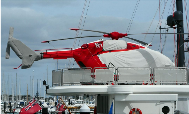
Eurocopter EC-135 Bubble, Engine, Rotor Hub, Tail Surfaces Covers

The Tailboom Cover details vary by model, but generally the helicopter tail boom cover encloses the tail boom from the "bottleneck" to the aft end. They usually also cover the horizontal stabilizers, and are custom made to allow for antennae, lights, and other protrusions. They attach with straps underneath the tail boom. Covers for the vertical and horizontal stabilizers are also available separately. Specific information for each model is available on request.