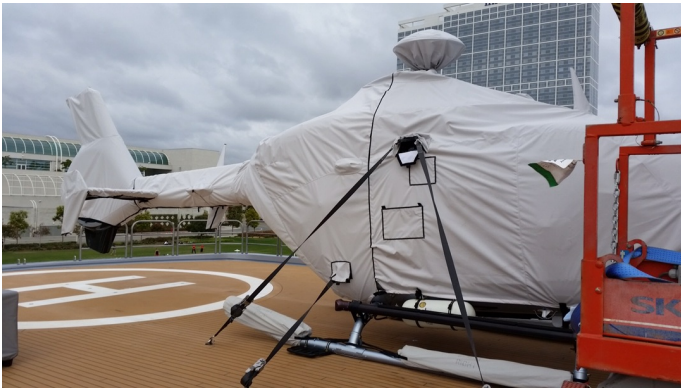
EC-135 Full Cover Set

The Tailboom Cover details vary by model, but generally the helicopter tail boom cover encloses the tail boom from the "bottleneck" to the aft end. They usually also cover the horizontal stabilizers, and are custom made to allow for antennae, lights, and other protrusions. They attach with straps underneath the tail boom. Covers for the vertical and horizontal stabilizers are also available separately. Specific information for each model is available on request.