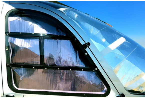
Airbus EC-135 Cockpit HeatShields

Heatshields are interior sunshades for an aircraft's windows or canopy glass. The product is a unique composite of closed-cell foam with a silver mylar finish. The semi-rigid design is stiff enough to stand along the inside of the windshield using sun visors or window framing. It folds up flat and easily stores in the included storage sleeve. Some designs may require velcro and suction cups. A Heatshield is an excellent short-term remedy for cockpit overheating.