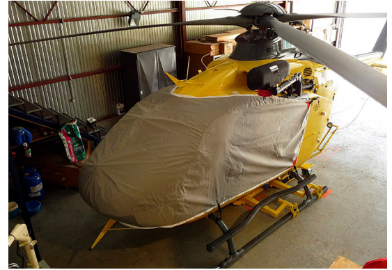
Eurocopter EC-135 Bubble Cover