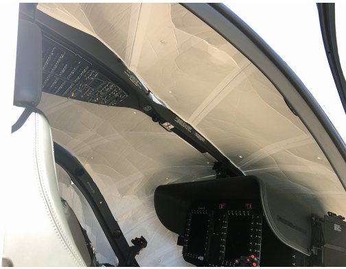
Eurocopter EC-145 Cockpit Heatshields

Heatshields are interior sunshades for an aircraft's windows or canopy glass. The product is a unique composite of closed-cell foam with a silver mylar finish. The semi-rigid design is stiff enough to stand along the inside of the windshield using sun visors or window framing. It folds up flat and easily stores in the included storage sleeve. Some designs may require velcro and suction cups. A Heatshield is an excellent short-term remedy for cockpit overheating.