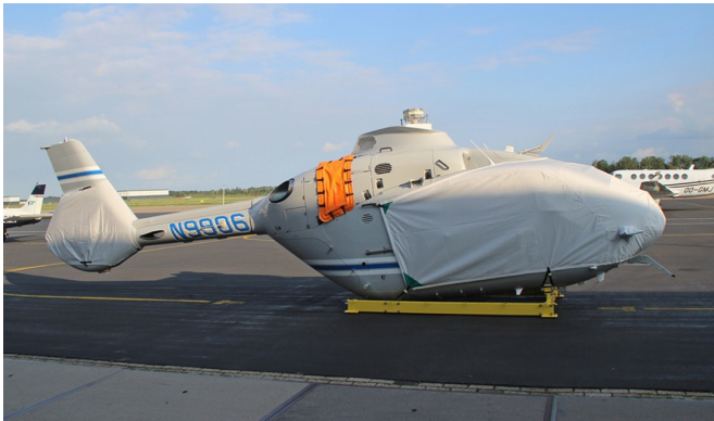
Eurocopter EC-135 Bubble & Tailfan Covers

This cover type is made from Silver Acrylic Sunbrella canvas and is 100% lined with a soft and smooth microfiber. Bruce's Custom Covers developed this material combination especially for aircraft protection. The outer material is medium weight and treated for water resistance, UV resistance and anti-static buildup. The inner lining is a very soft and smooth microfiber to prevent scratching. The material is very reflective, and tests show that the cabin interior temperature can be reduced to near-ambient temperature on the hottest of days. It is water, ice and snow repellent, yet breathable to allow moisture to escape from between the cover and the aircraft surface.