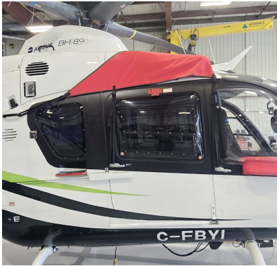
EC135 Intake Cover for FDC Aerofilter (IBF Filter)

The Airbus Helicopter EC-135 Intake Cover . Details vary by model, but generally helicopter intake covers are designed to enclose the intake are only. They are smaller than helicopter engine covers, and their attachment details can vary from straps, to snaps, or some combination of the two. Specific information for each model is available on request.