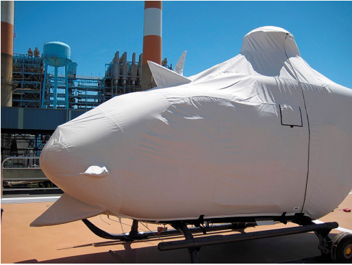
EC-135 Fuselage Cover