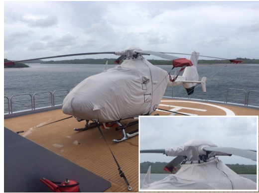
Airbus Helicopter AH135 Main Rotor Hub Cover