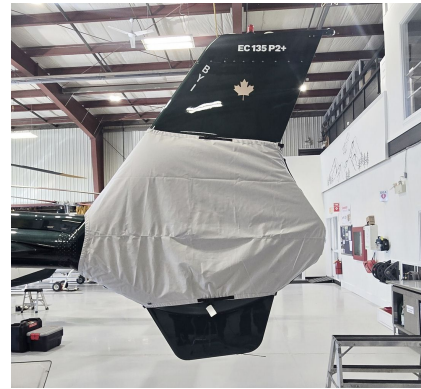
Airbus Helicopter EC-135 Tailfan Housing Fenestron Cover