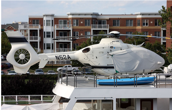
Eurocopter EC-135 Bubble Cover

This cover type is made from Silver Acrylic Sunbrella canvas and is 100% lined with a soft and smooth microfiber. Bruce's Custom Covers developed this material combination especially for aircraft protection. The outer material is medium weight and treated for water resistance, UV resistance and anti-static buildup. The inner lining is a very soft and smooth microfiber to prevent scratching. The material is very reflective, and tests show that the cabin interior temperature can be reduced to near-ambient temperature on the hottest of days. It is water, ice and snow repellent, yet breathable to allow moisture to escape from between the cover and the aircraft surface.