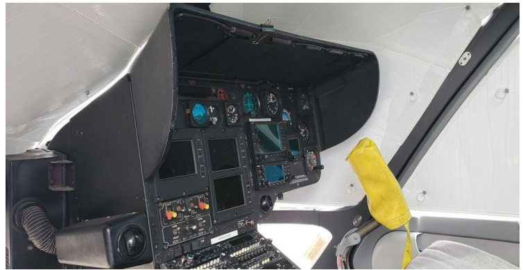
Airbus Helicopter H-135 Cockpit HeatShields