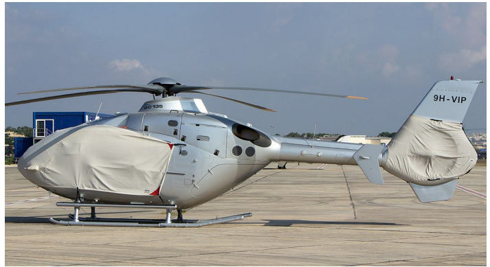
Eurocopter EC-135 Bubble Cover