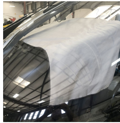
Eurocopter EC-135 Instrument Panel Heatshield Cover