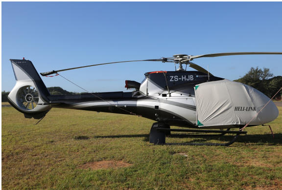
EC-130 Bubble Cover

This cover type is made from Silver Acrylic Sunbrella canvas and is 100% lined with a soft and smooth microfiber. Bruce's Custom Covers developed this material combination especially for aircraft protection. The outer material is medium weight and treated for water resistance, UV resistance and anti-static buildup. The inner lining is a very soft and smooth microfiber to prevent scratching. The material is very reflective, and tests show that the cabin interior temperature can be reduced to near-ambient temperature on the hottest of days. It is water, ice and snow repellent, yet breathable to allow moisture to escape from between the cover and the aircraft surface.