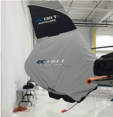
EC-130 Tailfan Cover

The Tailboom Cover details vary by model, but generally the helicopter tail boom cover encloses the tail boom from the "bottleneck" to the aft end. They usually also cover the horizontal stabilizers, and are custom made to allow for antennae, lights, and other protrusions. They attach with straps underneath the tail boom. Covers for the vertical and horizontal stabilizers are also available separately. Specific information for each model is available on request.