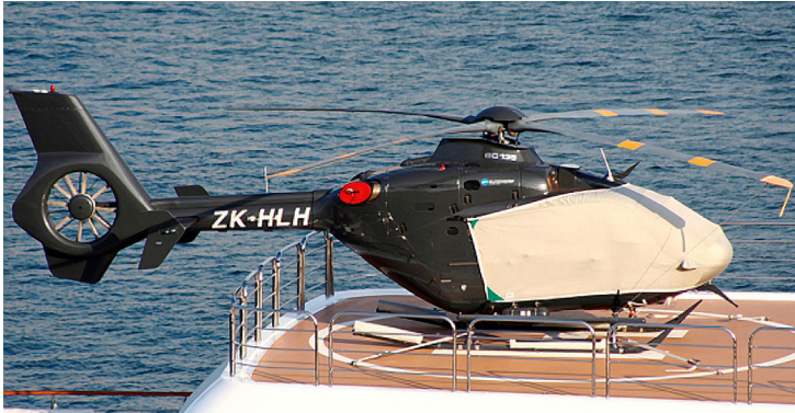
EC-135 Bubble Cover & Exhaust Plugs

This cover type is made from Silver Acrylic Sunbrella canvas and is 100% lined with a soft and smooth microfiber. Bruce's Custom Covers developed this material combination especially for aircraft protection. The outer material is medium weight and treated for water resistance, UV resistance and anti-static buildup. The inner lining is a very soft and smooth microfiber to prevent scratching. The material is very reflective, and tests show that the cabin interior temperature can be reduced to near-ambient temperature on the hottest of days. It is water, ice and snow repellent, yet breathable to allow moisture to escape from between the cover and the aircraft surface.