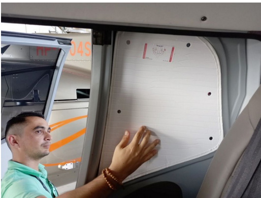
Airbus Helicopter EC130 B4 Side Window Heatshields