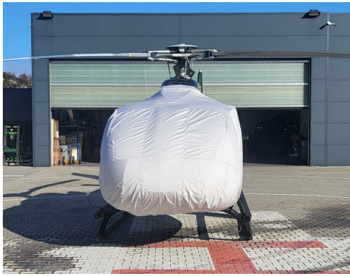
Airbus Helicopter H-130 Bubble Cover, Extends To Cover Fwd Engine Inlet