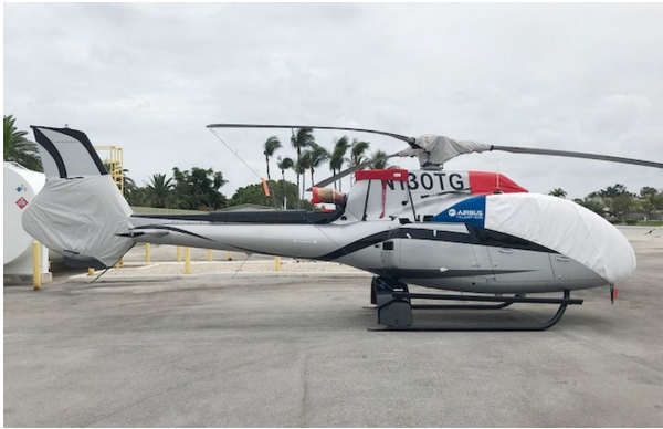
AIRBUS H130 T2, Intake, Exhaust & Tailfan Covers

cinched tight at the blade root with straps and quick-release plastic buckles. The Cold Weather Blade Covers are fitted with full-length zippers and optional deice “boots” designed to accept a preheater hose; a small opening at the tip of the cover allows for some air circulation and drainage in freezing weather. Some part numbers have features for an extra charge.