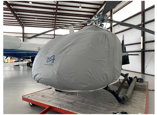
Airbus H-130 Bubble Cover, Travel Weight