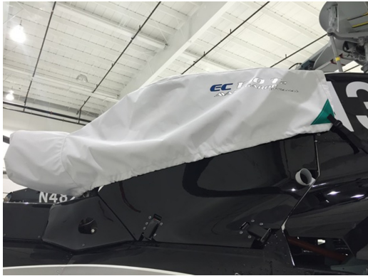
EC-130 Engine Area/Exhaust Cover