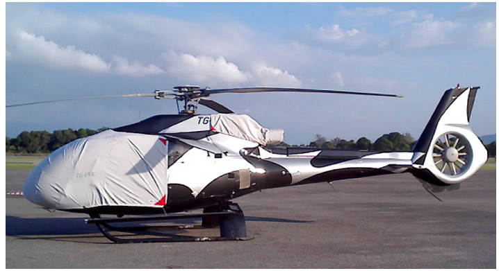
Bubble Cover and Intake/Exhaust Cover