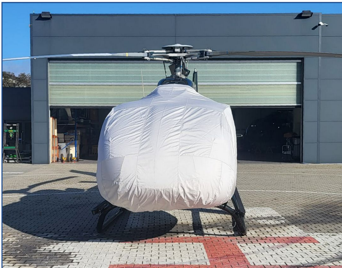
Airbus Helicopter H-130 Bubble Cover, Extends To Cover Fwd Engine Inlet