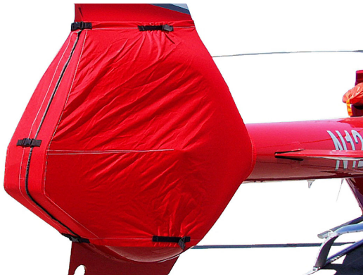
Eurocopter EC-120 Tailfan Cover

The Tailboom Cover details vary by model, but generally the helicopter tail boom cover encloses the tail boom from the "bottleneck" to the aft end. They usually also cover the horizontal stabilizers, and are custom made to allow for antennae, lights, and other protrusions. They attach with straps underneath the tail boom. Covers for the vertical and horizontal stabilizers are also available separately. Specific information for each model is available on request.