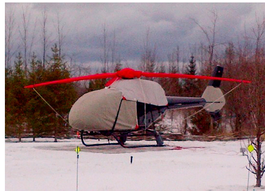
EC-130 Bubble, Engine, Rotor Hub, Blade & Tailfan Covers