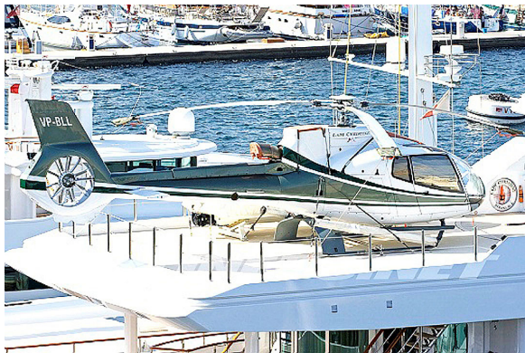
EC-130 Front, Side and Skylight Window HeatShields

Heatshields are interior sunshades for an aircraft's windows or canopy glass. The product is a unique composite of closed-cell foam with a silver mylar finish. The semi-rigid design is stiff enough to stand along the inside of the windshield using sun visors or window framing. It folds up flat and easily stores in the included storage sleeve. Some designs may require velcro and suction cups. A Heatshield is an excellent short-term remedy for cockpit overheating.