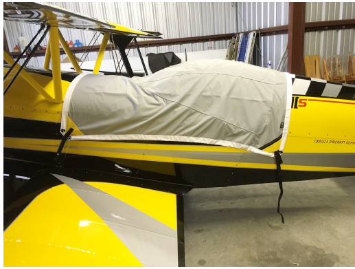
Acro Sport Acro II, Acroduster Travel Cover, Light Weight Travel Canopy Cover