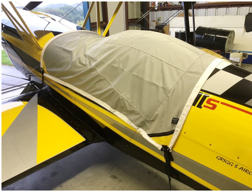
Acro Sport Acro II, Acroduster Travel Cover, Light Weight Travel Canopy Cover