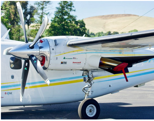
Aero Commander 690B Engine Inlet & Exhaust Plugs