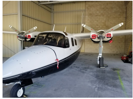
Aero Commander 500-A Pitot Covers