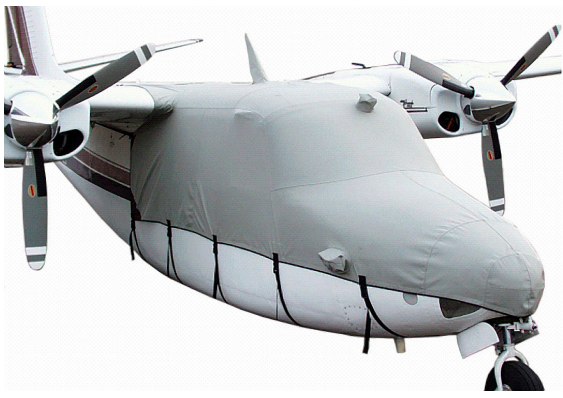
Canopy/Nose Cover (extends over top past leading edge)