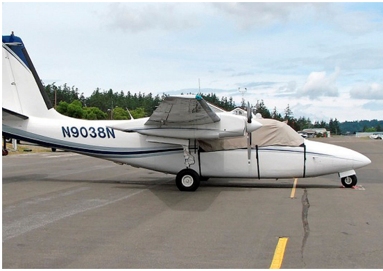
Aero Commander 500 Canopy Cover