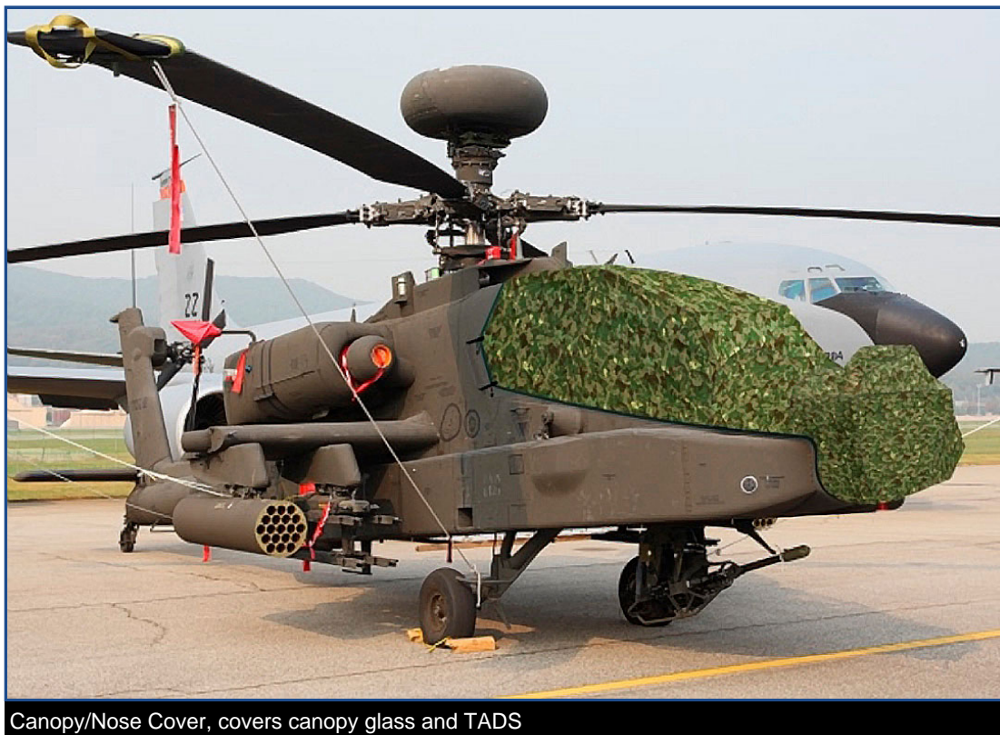
Canopy/Nose Cover, covers canopy glass and TADS