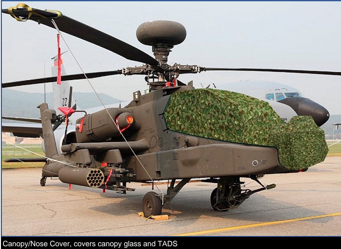
Canopy/Nose Cover, covers canopy glass and TADS