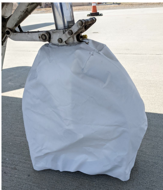
CJ1 Nose Gear Tire Cover, test fit

ALL-YEAR USE MATERIAL - Made with Silver Acrylic Sunbrella canvas, the all-year use material is the best option for sun protection and cover longevity. This heavier more durable material is intended for all weather conditions, such as rain and snow or lots of sun.