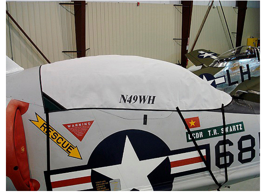
A-4 Skyhawk Canopy Cover