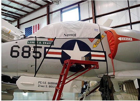
A-4 Skyhawk Canopy Cover

Travel Covers are made with Silver Solution-Dyed Polyester fabric and only lined over the windshield to save weight. The material is lightweight and more compact for easy stowage in the aircraft. The polyester material is water resistant, but only intended for occasional use outside. We also have an ultra lightweight material available for fitted hangar dust covers. For daily outdoor use, the non-travel Sunbrella Cover is the best choice.