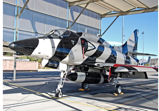
A4 Skyhawk Engine Inlet Plugs