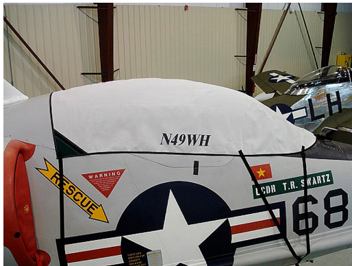
A-4 Skyhawk Canopy Cover

This cover type is made from Silver Acrylic Sunbrella canvas and is 100% lined with a soft and smooth microfiber. Bruce's Custom Covers developed this material combination especially for aircraft protection. The outer material is medium weight and treated for water resistance, UV resistance and anti-static buildup. The inner lining is a very soft and smooth microfiber to prevent scratching. The material is very reflective, and tests show that the cabin interior temperature can be reduced to near-ambient temperature on the hottest of days. It is water, ice and snow repellent, yet breathable to allow moisture to escape from between the cover and the aircraft surface.