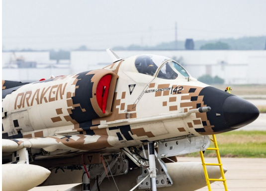
McDonnell Douglas A4 Skyhawk Engine Intake Plugs

The Engine Inlet Plugs are custom fit for your McDonnell Douglas A-4 Skyhawk, single & tandem intakes, made with heavy-duty vinyl material, and stuffed with a single block of sculpted urethane foam. Each plug has a zipper that allows the foam to be removed and dried if necessary. Engine plugs have 'remove before flight' streamers sewn onto the face of the plugs. Most plugs are imprinted with the aircraft registration number in black for an extra charge. Storage bag NOT included. Engine plugs may be inserted after flight when the engine is still warm. Engine Inlet Plugs are commonly referred to as Cowl Plugs, Intake Plugs, Cowl Blocks, Engine Blocks, and Engine Bunges.