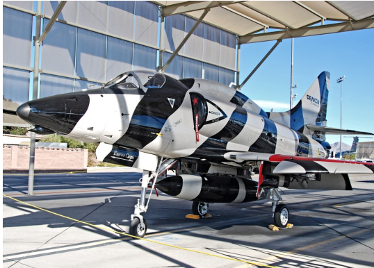
A4 Skyhawk Engine Inlet Plugs

The Engine Inlet Plugs are custom fit for your McDonnell Douglas A-4 Skyhawk, single & tandem intakes, made with heavy-duty vinyl material, and stuffed with a single block of sculpted urethane foam. Each plug has a zipper that allows the foam to be removed and dried if necessary. Engine plugs have 'remove before flight' streamers sewn onto the face of the plugs. Most plugs are imprinted with the aircraft registration number in black for an extra charge. Storage bag NOT included. Engine plugs may be inserted after flight when the engine is still warm. Engine Inlet Plugs are commonly referred to as Cowl Plugs, Intake Plugs, Cowl Blocks, Engine Blocks, and Engine Bungs.