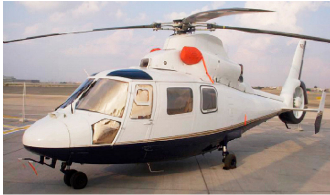
Dauphin HeatShield Set

foam with a silver mylar finish. The semi-rigid design is stiff enough to stand along the inside of the windshield using sun visors or window framing. It folds up flat and easily stores in the included storage sleeve. Some designs may require velcro and suction cups. A Heatshield is an excellent short-term remedy for cockpit overheating.