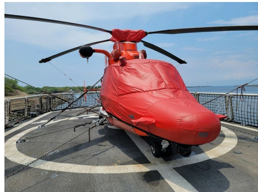
Aerospatiale AS365N2 Bubble, w/Extended Nose/Radome