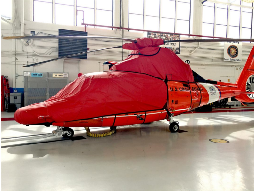
U.S. Coast Guard HH-65 Dolphin Bubble, Engine & Rotor Mast Covers

This cover type is made from Silver Acrylic Sunbrella canvas and is 100% lined with a soft and smooth microfiber. Bruce's Custom Covers developed this material combination especially for aircraft protection. The outer material is medium weight and treated for water resistance, UV resistance and anti-static buildup. The inner lining is a very soft and smooth microfiber to prevent scratching. The material is very reflective, and tests show that the cabin interior temperature can be reduced to near-ambient temperature on the hottest of days. It is water, ice and snow repellent, yet breathable to allow moisture to escape from between the cover and the aircraft surface.