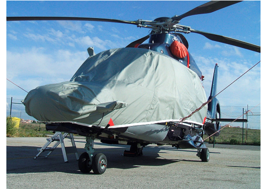
Dauphin Bubble Cover, extended nose