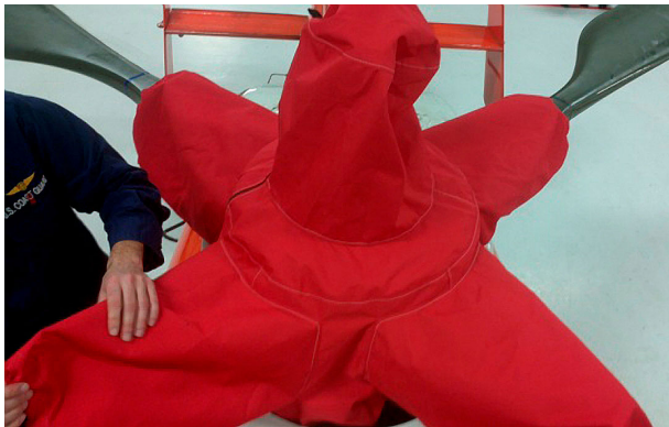
MH-65C Rotor Hub Cover w/ OADS Tube Cover detail

Insulated Covers Material - A special composite material of solution-dyed polyester, 3M Thinsulate insulation, and soft nylon interior fabric. Our insulated covers are designed to complement an engine preheater and help retain heat in the engine compartment after shutdown. If you operate your aircraft in cold-weather, these covers will help prevent engine wear and tear.