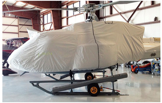
AS350 B3 Main Body Cover (Covers Bubble/Cabin, Engine Area and Exhaust)