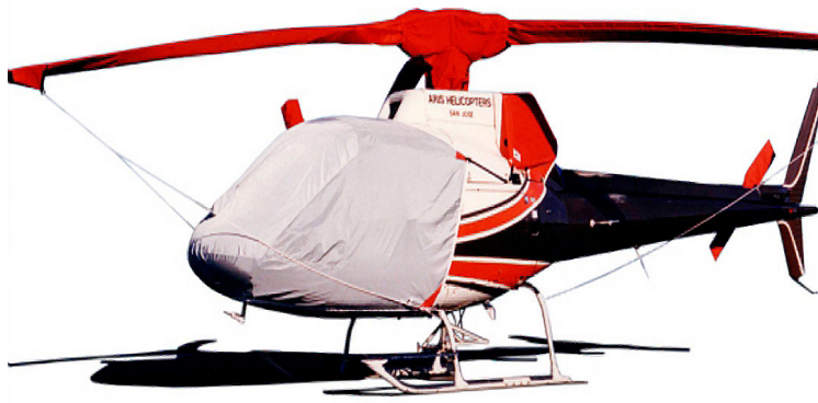
Bubble Cover, Intake/Exhaust, Rotor Mast, Tail Rotor & Main Body Covers