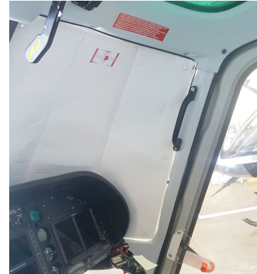
Aerospatiale AS350 Astar, Ecureuil, Esquilo, Fenec Windshield Heatshields