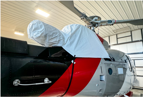
Airbus Helicopter AS350-B3 Intake/Exhaust Cover, test fit cover

WINTER USE MATERIAL - Made with Solution-Dyed Polyester fabric, this option is intended for seasonal use to aid in deicing, rain mitigation, or for occasional travel. The material is lighter and more compact, but more susceptible to UV damage and may have a shorter useful life if used continuously outside than the all-year use material.