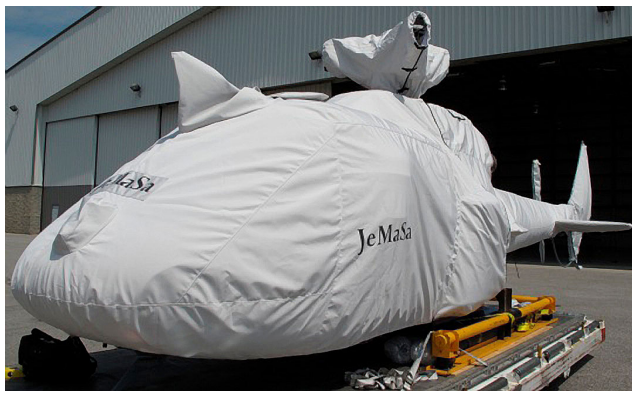
AS350 Main Body Cover, Main Rotor Hub, Tailboom, Tail Rotor Covers