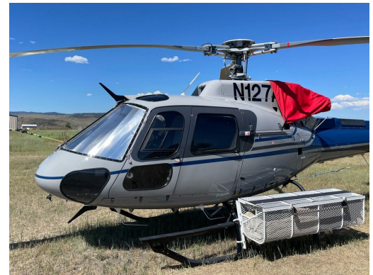
Eurocopter AS350-B3 Cabin HeatShields, Intake/Exhaust Cover