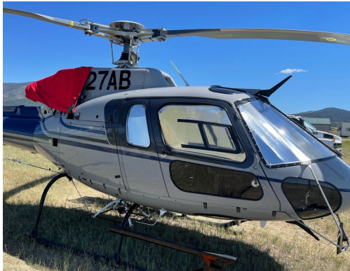
Eurocopter AS350-B3 Cabin HeatShields, Intake/Exhaust Cover

Heatshields are interior sunshades for an aircraft's windows or canopy glass. The product is a unique composite of closed-cell foam with a silver mylar finish. The semi-rigid design is stiff enough to stand along the inside of the windshield using sun visors or window framing. It folds up flat and easily stores in the included storage sleeve. Some designs may require velcro and suction cups. A Heatshield is an excellent short-term remedy for cockpit overheating.