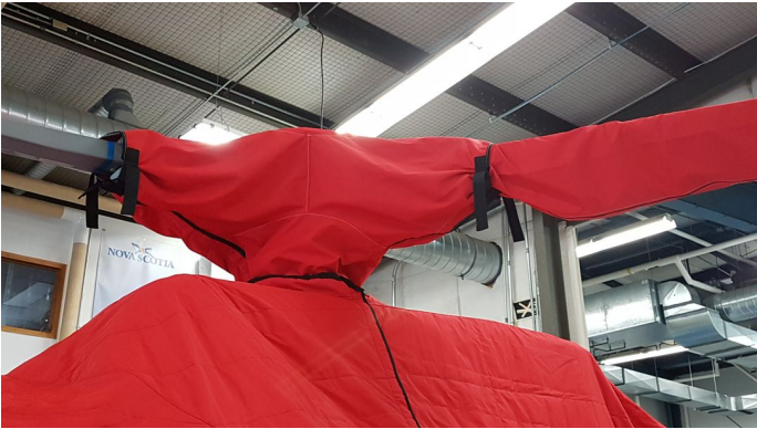
H125 MAIN ROTOR HUB COVER