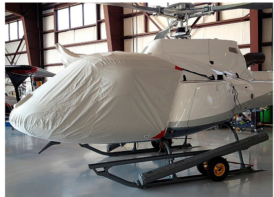
AS350 B3 Bubble Cover