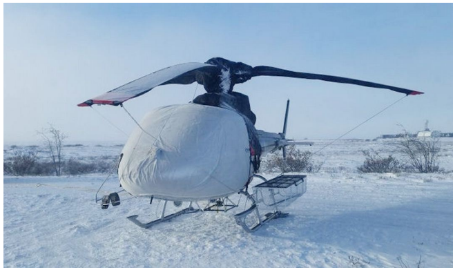
Airbus Helicopter AS350 Bubble Cover, Blade Tie-Downs, Blade Covers & Rotor Head Cover

WINTER USE MATERIAL - Made with Solution-Dyed Polyester fabric, this option is intended for seasonal use to aid in deicing, rain mitigation, or for occasional travel. The material is lighter and more compact, but more susceptible to UV damage and may have a shorter useful life if used continuously outside than the all-year use material.