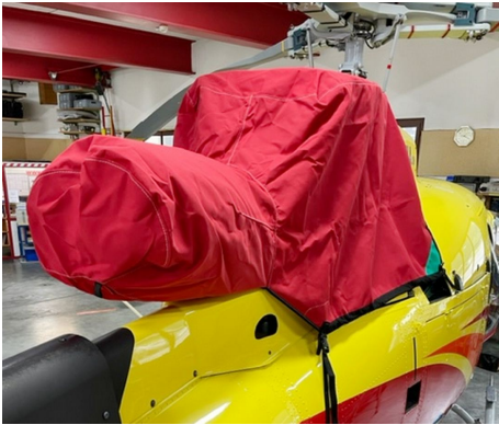
Airbus Helicopter H-125 & AS350 Intake/Exhaust Cover (newer design)

WINTER USE MATERIAL - Made with Solution-Dyed Polyester fabric, this option is intended for seasonal use to aid in deicing, rain mitigation, or for occasional travel. The material is lighter and more compact, but more susceptible to UV damage and may have a shorter useful life if used continuously outside than the all-year use material.