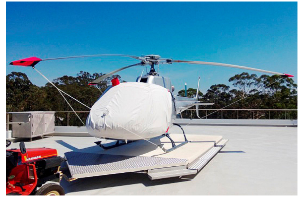
AS350 Bubble Cover, Blade Tie-downs