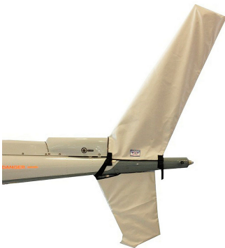
AS350B3 Vertical Stabilizers cover