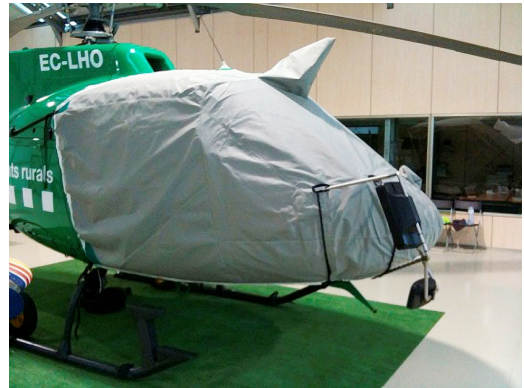
AS350 Bubble Cover with Wire Strike and Cargo Mirror