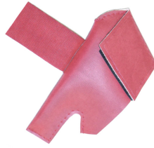
AS350 Pitot Cover

vinyl material, and stuffed with a single block of sculpted urethane foam. Each plug has a zipper that allows the foam to be removed and dried if necessary. Engine plugs have 'Remove Before Flight' streamers sewn onto the face of the plugs. Most plugs are imprinted with the aircraft registration number in black for an extra charge. Storage bag NOT included. Engine plugs may be inserted after flight when the engine is still warm. Engine Inlet Plugs are commonly referred to as Cowl Plugs, Intake Plugs, Cowl Blocks, Engine Blocks, and Engine Bunges.