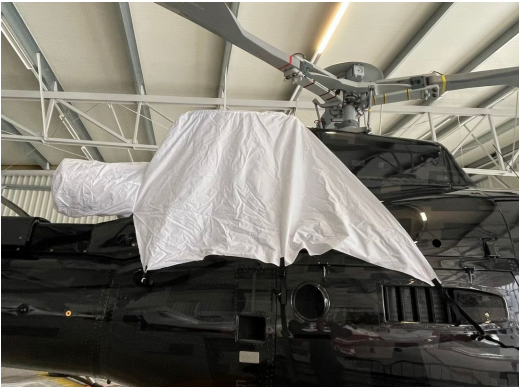
AS350 Intake/Exhaust Cover, test fit cover