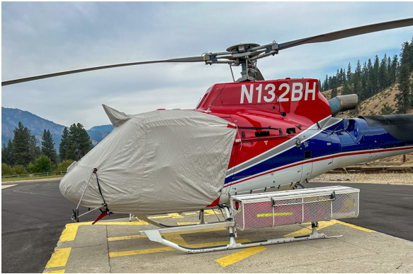
Eurocopter AS350-B3 Bubble Cover w/Wire Strike &amp; Cargo Mirror details.

Travel Covers are made with Silver Solution-Dyed Polyester fabric and fully lined over the entire cover. The material is lightweight and more compact for easy storage in the aircraft. The polyester material is water resistant, but only intended for occasional use outside. We also have an ultra lightweight material available for fitted hangar dust covers. For daily outdoor use, the non-travel Sunbrella Cover is the best choice.