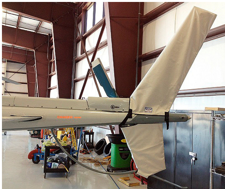
AS350 B3 Vertical Stabilizer Covers (set of 2)

The Tailboom Cover details vary by model, but generally the helicopter tail boom cover encloses the tail boom from the "bottleneck" to the aft end. They usually also cover the horizontal stabilizers, and are custom made to allow for antennae, lights, and other protrusions. They attach with straps underneath the tail boom. Covers for the vertical and horizontal stabilizers are also available separately. Specific information for each model is available on request.