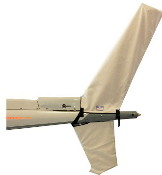
AS350B3 Vertical Stabilizers cover