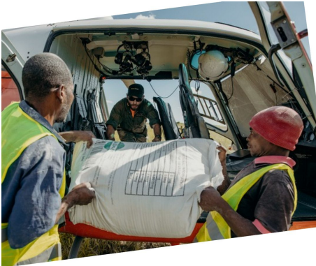
AS350 Windshield Heatshields