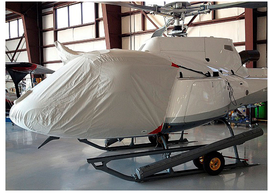
AS350 B3 Bubble Cover