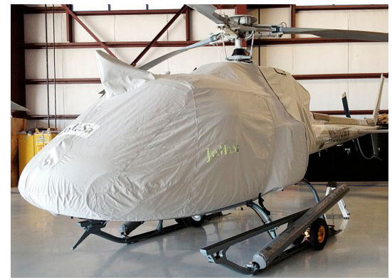
Eurocopter AS350 Main Body Cover