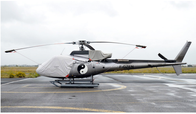
Aerospatiale Bubble and Intake/Exhaust Cover