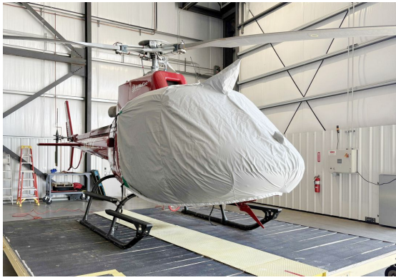
Airbus Helicopter H-125 Bubble Cover w/Wire Strike