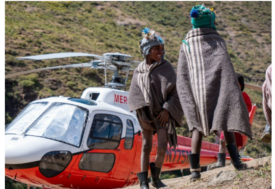
AS350 Windshield Heatshields