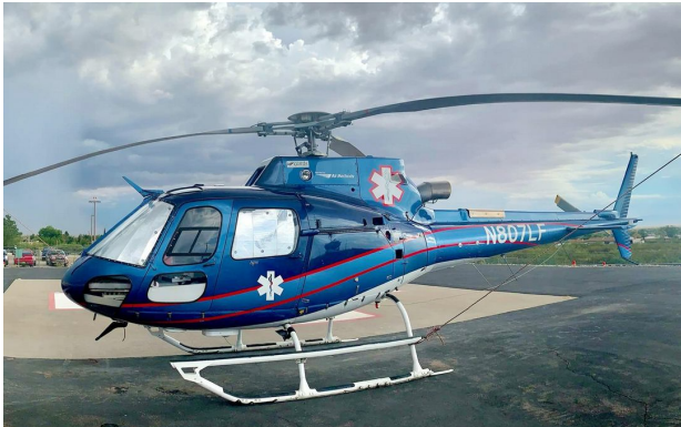
Aerospatiale AS350 Cockpit Heatshields

Heatshields are interior sunshades for an aircraft's windows or canopy glass. The product is a unique composite of closed-cell foam with a silver mylar finish. The semi-rigid design is stiff enough to stand along the inside of the windshield using sun visors or window framing. It folds up flat and easily stores in the included storage sleeve. Some designs may require velcro and suction cups. A Heatshield is an excellent short-term remedy for cockpit overheating.