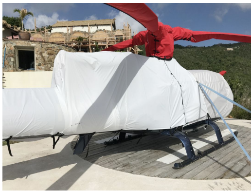
Aerospatiale Gazelle AS341 Bubble, Rotor Mast, Blade, Engine & Tailboom Covers (some are test fit covers)