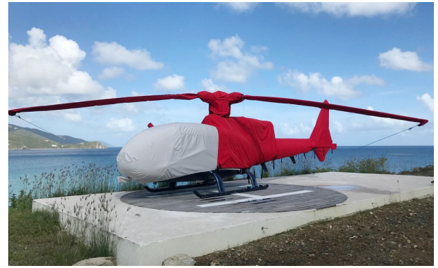
Aerospatiale AS341/342 Gazelle Full Cover Set