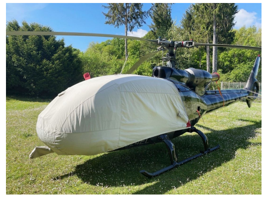
Aerospatiale Gazelle Bubble Cover