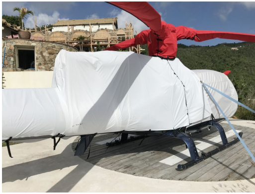
Aerospatiale Gazelle AS341 Bubble, Rotor Mast, Blade, Engine & Tailboom Covers (some are test fit covers)