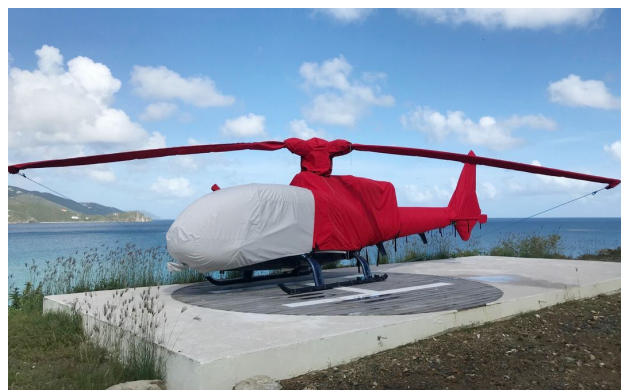
Aerospatiale AS341/342 Gazelle Full Cover Set