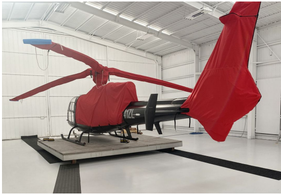
Aerospatiale Gazelle Engine, Rotor Hub, Blades & Tailfan Covers