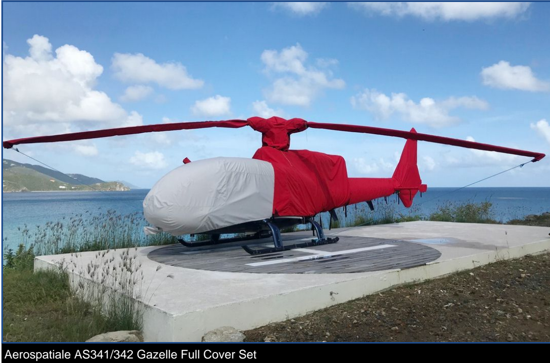
Aerospatiale AS341/342 Gazelle Full Cover Set