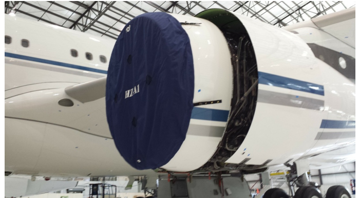
Airbus 340 Intake Covers