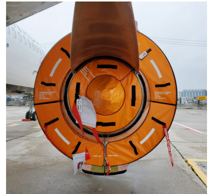
Airbus A320 Exhaust & Bypass Vent Plugs