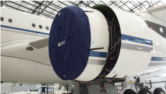
Airbus 340 Intake Covers

The Engine Inlet Plugs are custom fit for your Airbus A340 intakes, made with heavy-duty vinyl material, and stuffed with a single block of sculpted urethane foam. Each plug has a zipper that allows the foam to be removed and dried if necessary. Engine plugs have 'remove before flight' streamers sewn onto the face of the plugs. Most plugs are imprinted with the aircraft registration number in black for an extra charge. Storage bag NOT included. Engine plugs may be inserted after flight when the engine is still warm. Engine Inlet Plugs are commonly referred to as Cowl Plugs, Intake Plugs, Cowl Blocks, Engine Blocks, and Engine Bungs.