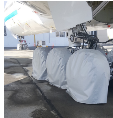
Boeing 777 Main &amp; Nose Gear Tire Covers