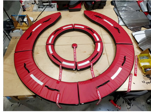
Boeing 747-8 Exhaust Plugs