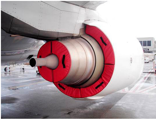
Boeing 737 Bypass and Exhaust Plugs

The Engine Exhaust Plugs are custom fit for your Airbus A330, A350 exhaust openings, made with heavy-duty vinyl material, and stuffed with a single block of sculpted urethane foam. Each plug has a zipper that allows the foam to be removed and dried if necessary. Exhaust plugs have 'remove before flight' streamers sewn onto the face of the plugs. Most plugs are imprinted with the aircraft registration number in black for an extra charge. Exhaust plugs may be inserted soon after flight when the engine is still warm. Engine Inlet Plugs are commonly referred to as Cowl Plugs, Intake Plugs, Cowl Blocks, Engine Blocks, and Engine Bungs.