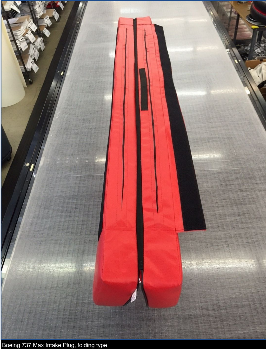
Boeing 737 Max Intake Plug, folding type