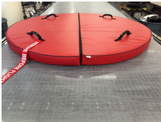
Boeing 737 Max Intake Plug, folding type

The Engine Inlet Plugs are custom fit for your Airbus A320 intakes, made with heavy-duty vinyl material, and stuffed with a single block of sculpted urethane foam. Each plug has a zipper that allows the foam to be removed and dried if necessary. Engine plugs have 'remove before flight' streamers sewn onto the face of the plugs. Most plugs are imprinted with the aircraft registration number in black for an extra charge. Storage bag NOT included. Engine plugs may be inserted after flight when the engine is still warm. Engine Inlet Plugs are commonly referred to as Cowl Plugs, Intake Plugs, Cowl Blocks, Engine Blocks, and Engine Bungs.