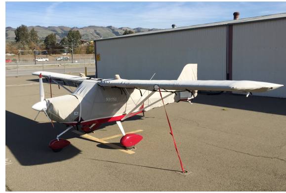
Eurofox Canopy, Engine, Wings and Empennage Covers