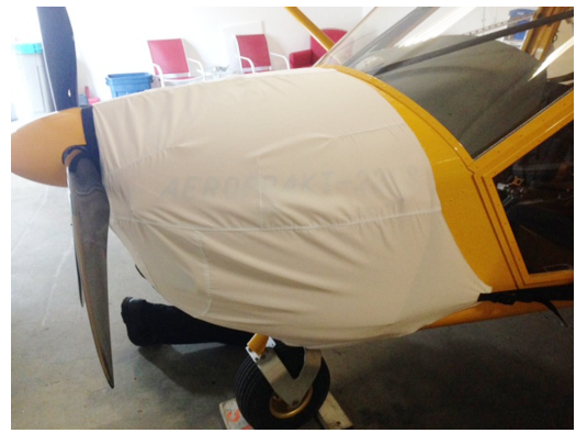
A-22 Engine Cover, test fit