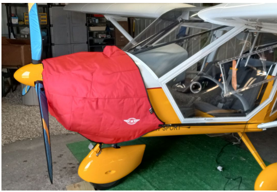
Aeroprakt A-22 Insulated Engine Cover