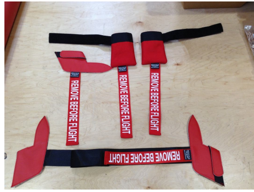
Airbus A319 Pitot & Tat Covers, Heat Resistant Type