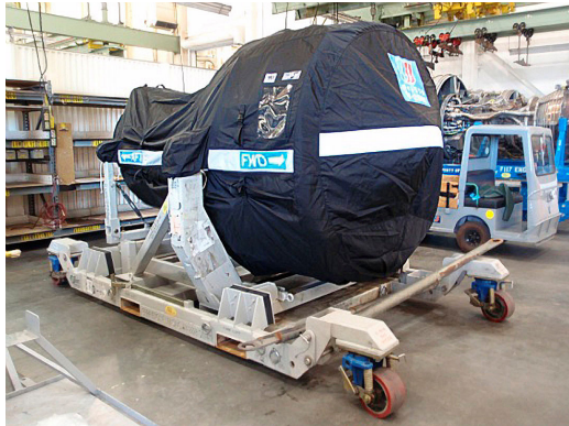
QEC OFF-LINK JET ENGINE COVER, V2500 Series, fully enclosed

ALL-YEAR USE MATERIAL - Made with Solution dyed Polyester fabric, the all-year use material is the best option for sun protection and cover longevity. This heavier more durable material is intended for all weather conditions, such as rain and snow or lots of sun.