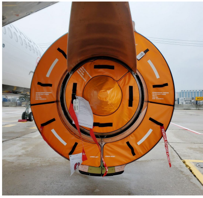
Airbus A320 Exhaust & Bypass Vent Plugs